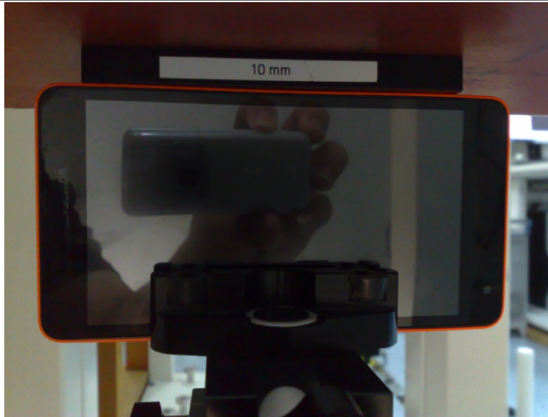
Photo of the device positioned for WR mode measurement – left edge facing phantom. The spacer was removed before the start of the measurements.