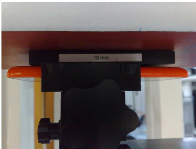
Photo of the device positioned for WR mode measurement –back facing phantom. The spacer was removed before the start of the measurements.

The device was placed in the SPEAG holder and, in sequence, the back, display and each of the 4 edges was positioned 10.0mm away from the flat phantom. The spacer was removed before the start of the measurements.