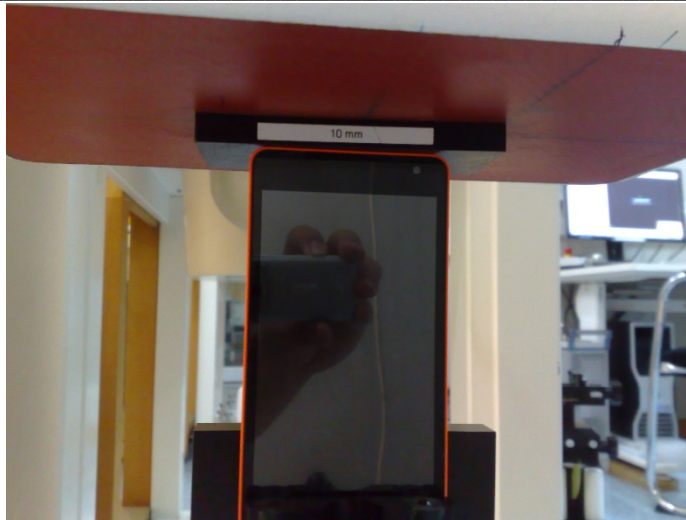
Photo of the device positioned for WR mode measurement – top edge facing phantom. The spacer was removed before the start of the measurements.