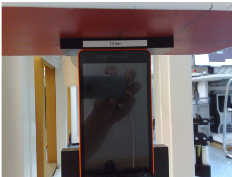
Photo of the device positioned for WR mode measurement – bottom edge facing phantom. The spacer was removed before the start of the measurements.