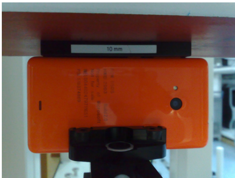
Photo of the device positioned for WR mode measurement – right edge facing phantom. The spacer was removed before the start of the measurements