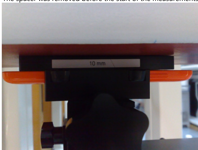
Photo of the device positioned for WR mode measurement – display facing phantom. The spacer was removed before the start of the measurements.