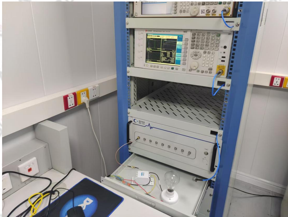
Conducted Emissions from the AC mains power ports