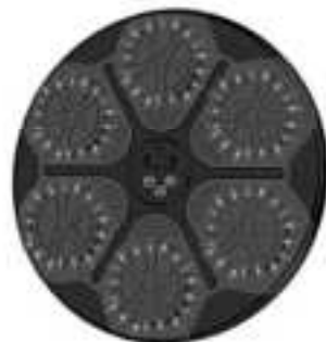
Smart music boxing target Instruction Manual