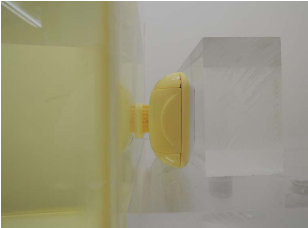
Back Surface, 0mm separation