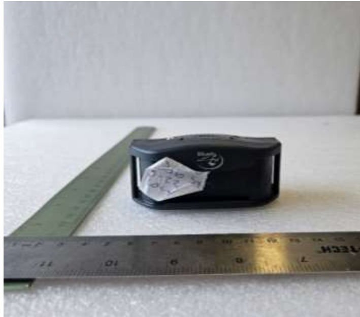
Figure 5. Front of EUT

FCC Part 15 Certification/ RSS 210 KE3-3003444 2721A-3003444 23-0110 and 23-0107 July 13, 2023 Radio Systems Corporation 300-3444 and 300-3446