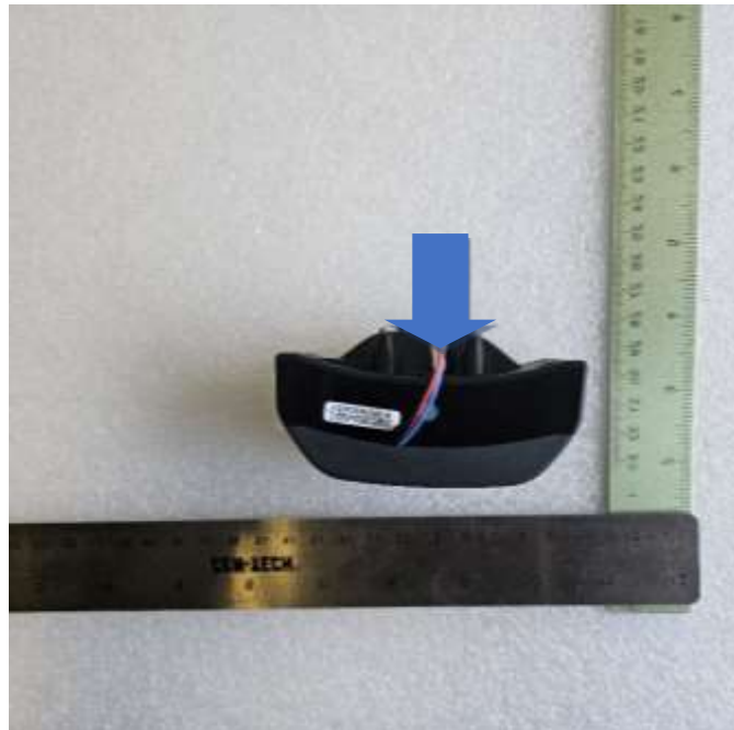
Figure 1. Top of EUT

Note: Cable indicated above are for programming purposes only