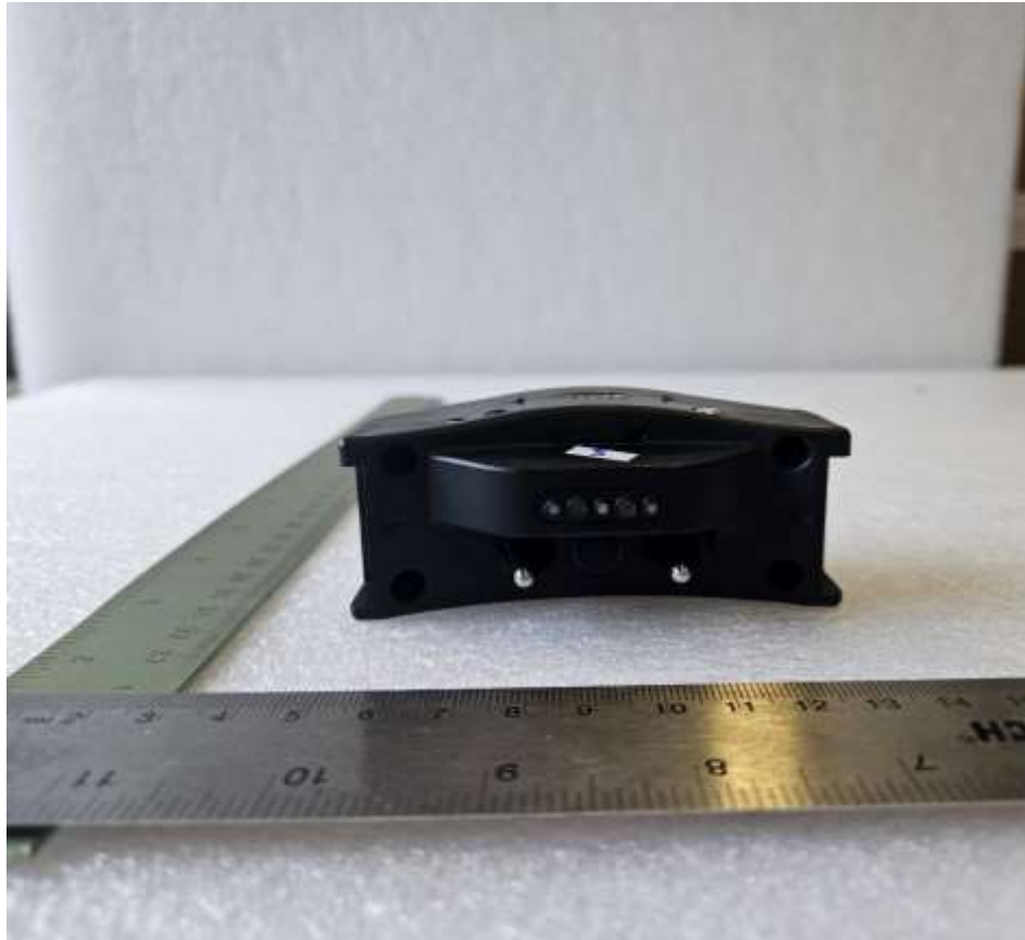
Figure 2. Back of EUT

FCC Part 15 Certification/ RSS 210 KE3-3003444 2721A-3003444 23-0110 and 23-0107 July 13, 2023 Radio Systems Corporation 300-3444 and 300-3446