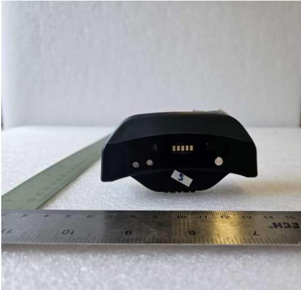
Figure 6. Bottom of EUT

FCC Part 15 Certification/ RSS 210 KE3-3003444 2721A-3003444 23-0110 and 23-0107 July 13, 2023 Radio Systems Corporation 300-3444 and 300-3446