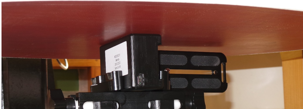
Photograph Number 04. Front Side Position