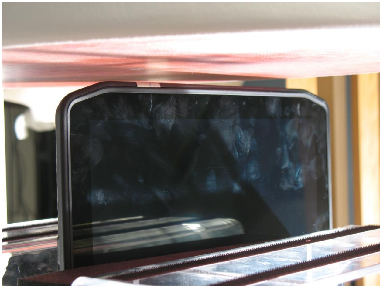
Figure 4: Device Positioning for SAR Scans – Top Edge with 9mm Spacing