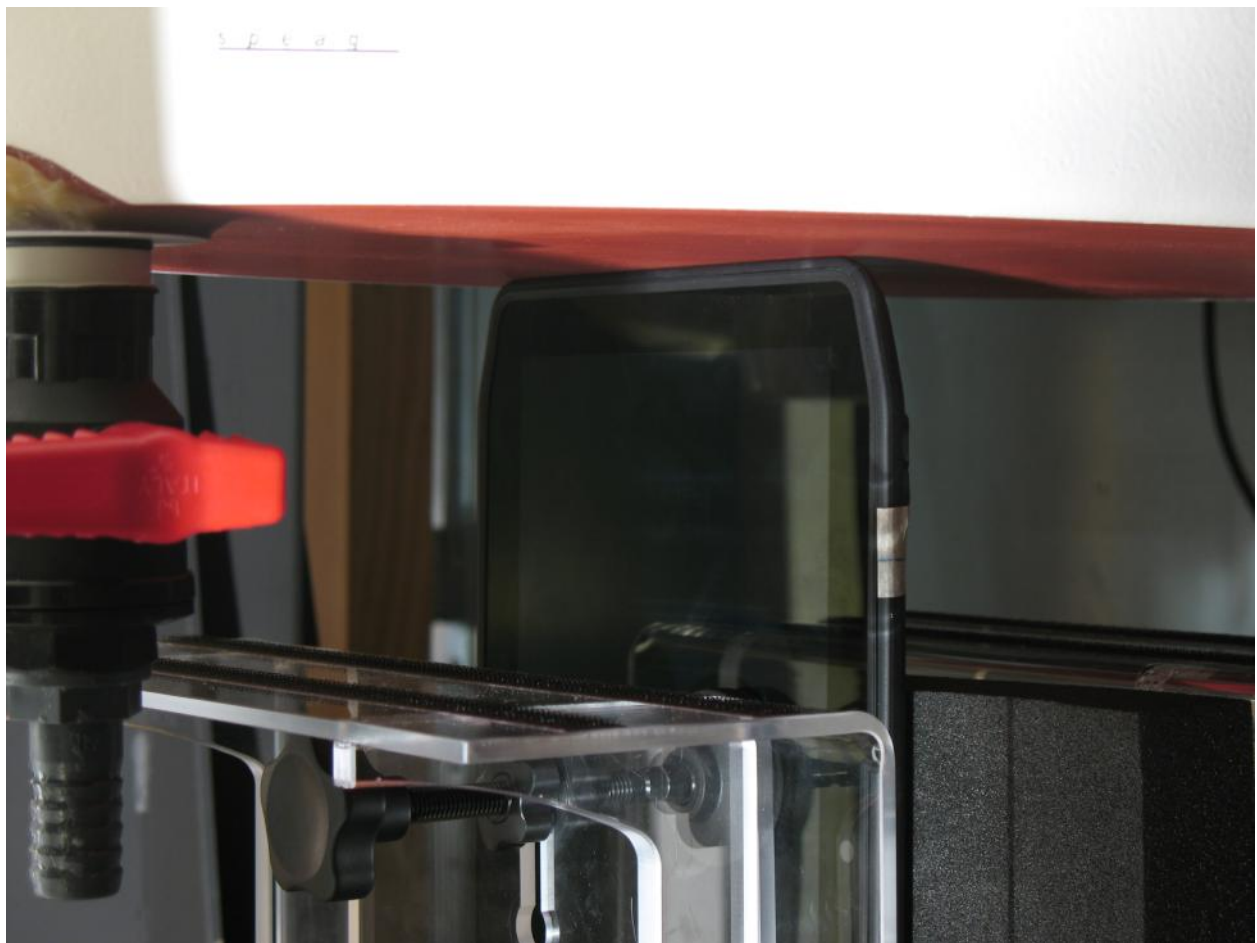
Figure 7: Device Positioning for SAR Scans – Left Edge Nearest WWAN Antennas with no Spacing