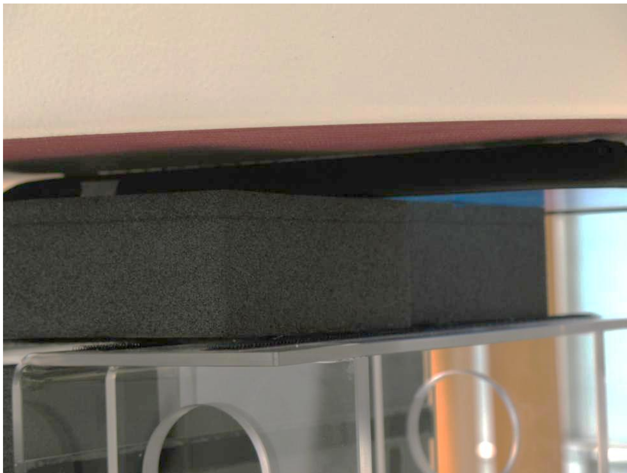
Figure 1: Device Positioning for SAR Scans – Back Against Phantom with No Spacing