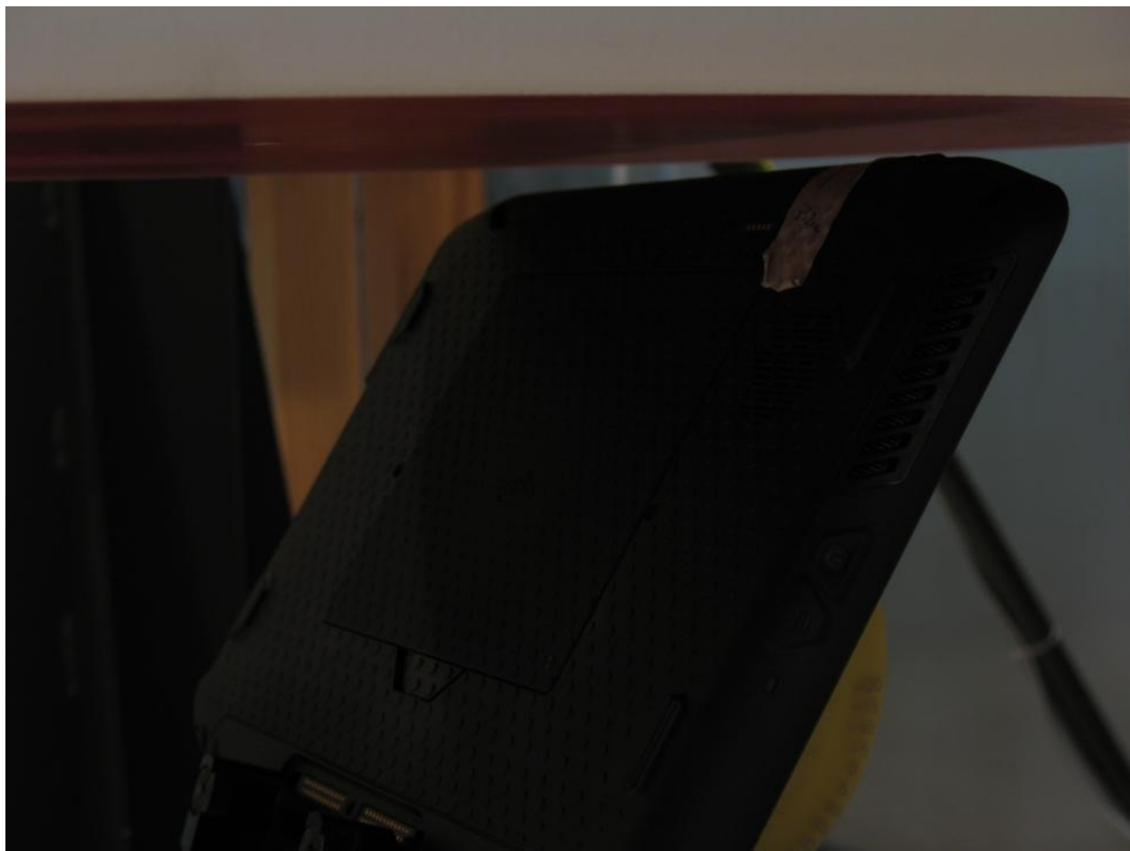
Figure 6: Device Positioning for SAR Scans – Top Edge Tilted 57 deg with 11mm Spacing