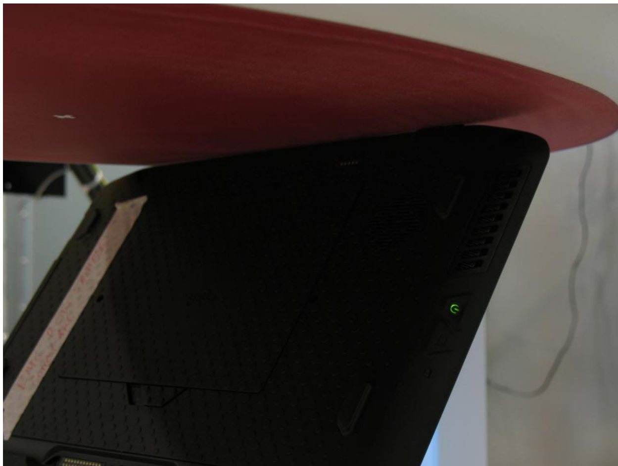
Figure 5: Device Positioning for SAR Scans – Top Edge Tilted 57 deg with no Spacing