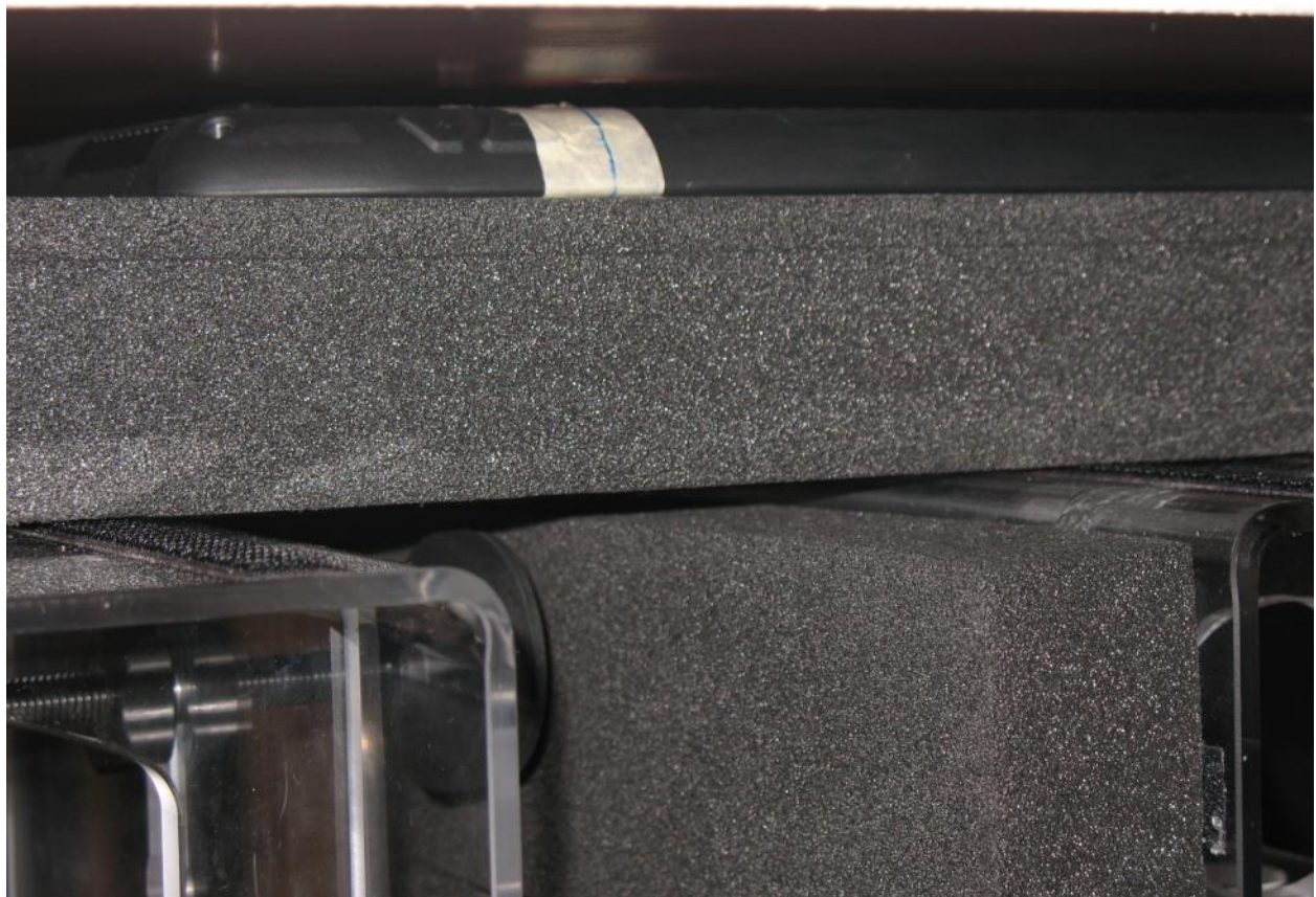
Figure 2: Device Positioning for SAR Scans - Back Against Phantom with 5mm Spacing