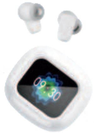
S09 Bluetooth Earphones