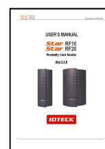
Quick Installation Guide (1 copy)