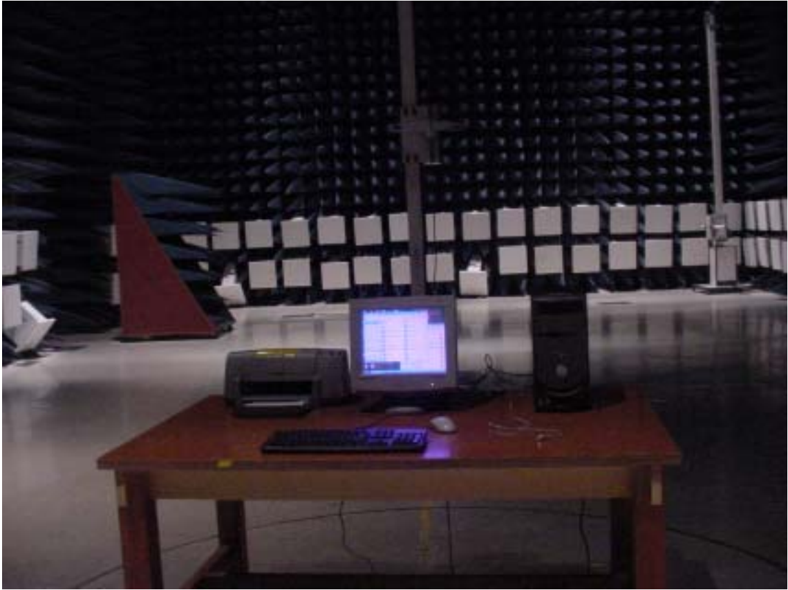
<FRONT PHOTO OF RADIATED DISTURBANCE >