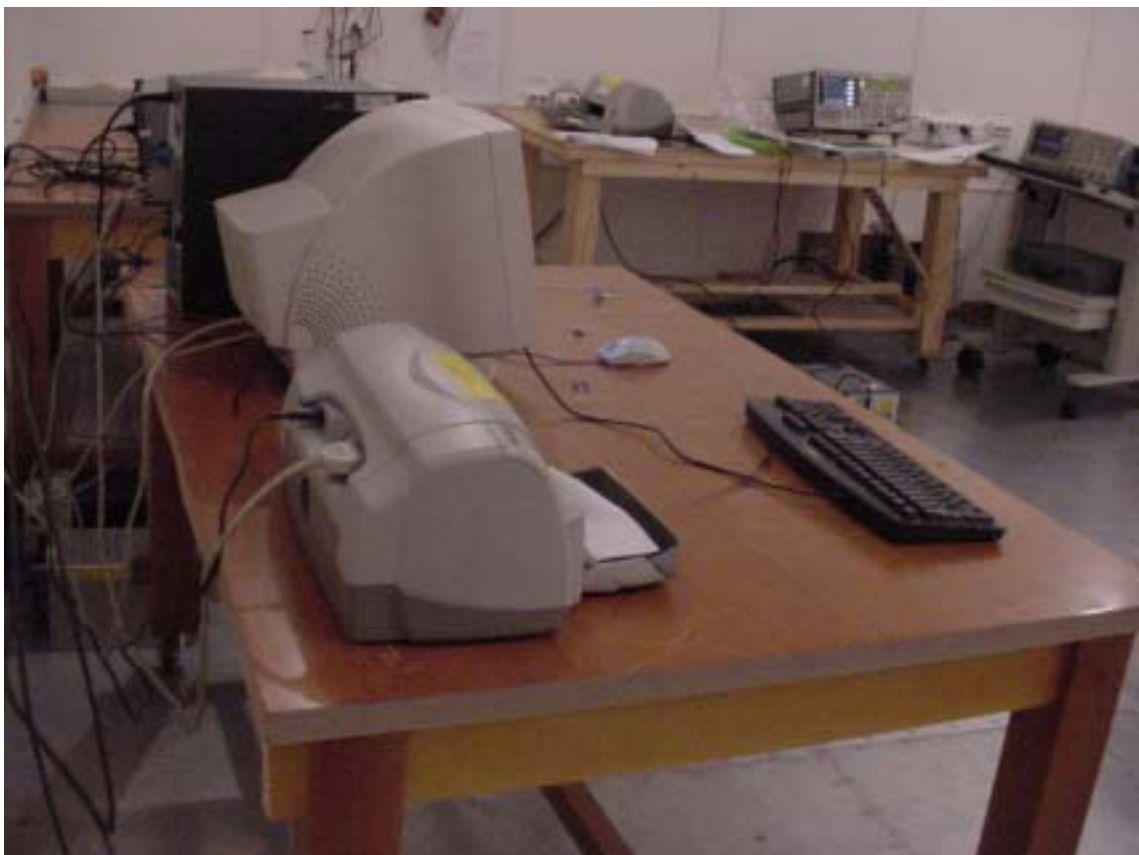
<SIDE PHOTO OF CONTINUOUS DISTURBANCE VOLTAGE >