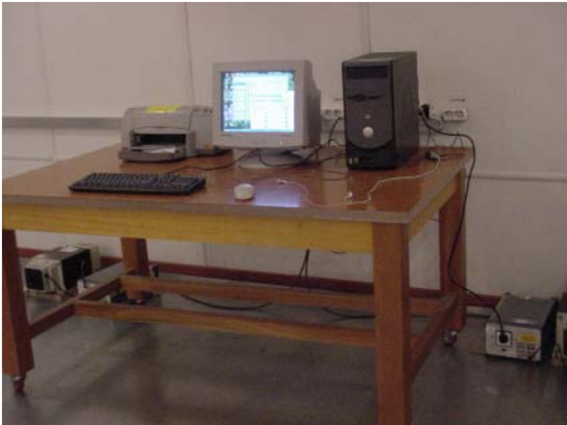
<FRONT PHOTO OF CONTINUOUS DISTURBANCE VOLTAGE >