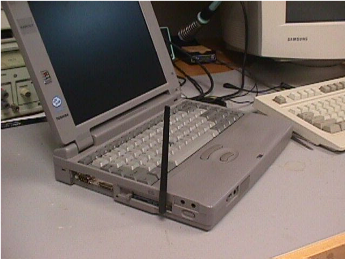
Figure 4: PCMCIA Card Prospective View – Shows card inside laptop