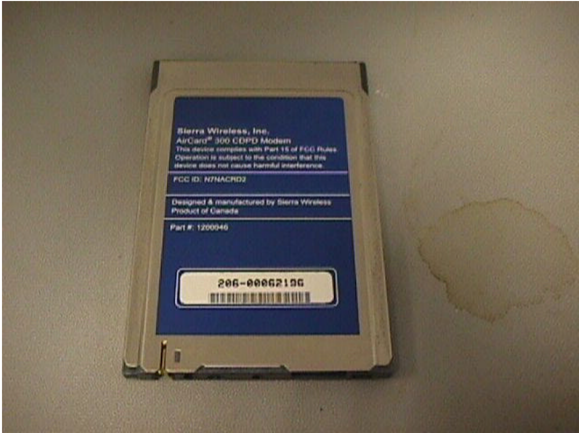
Figure 2: PCMCIA Card Bottom – Shows FCC label format and position