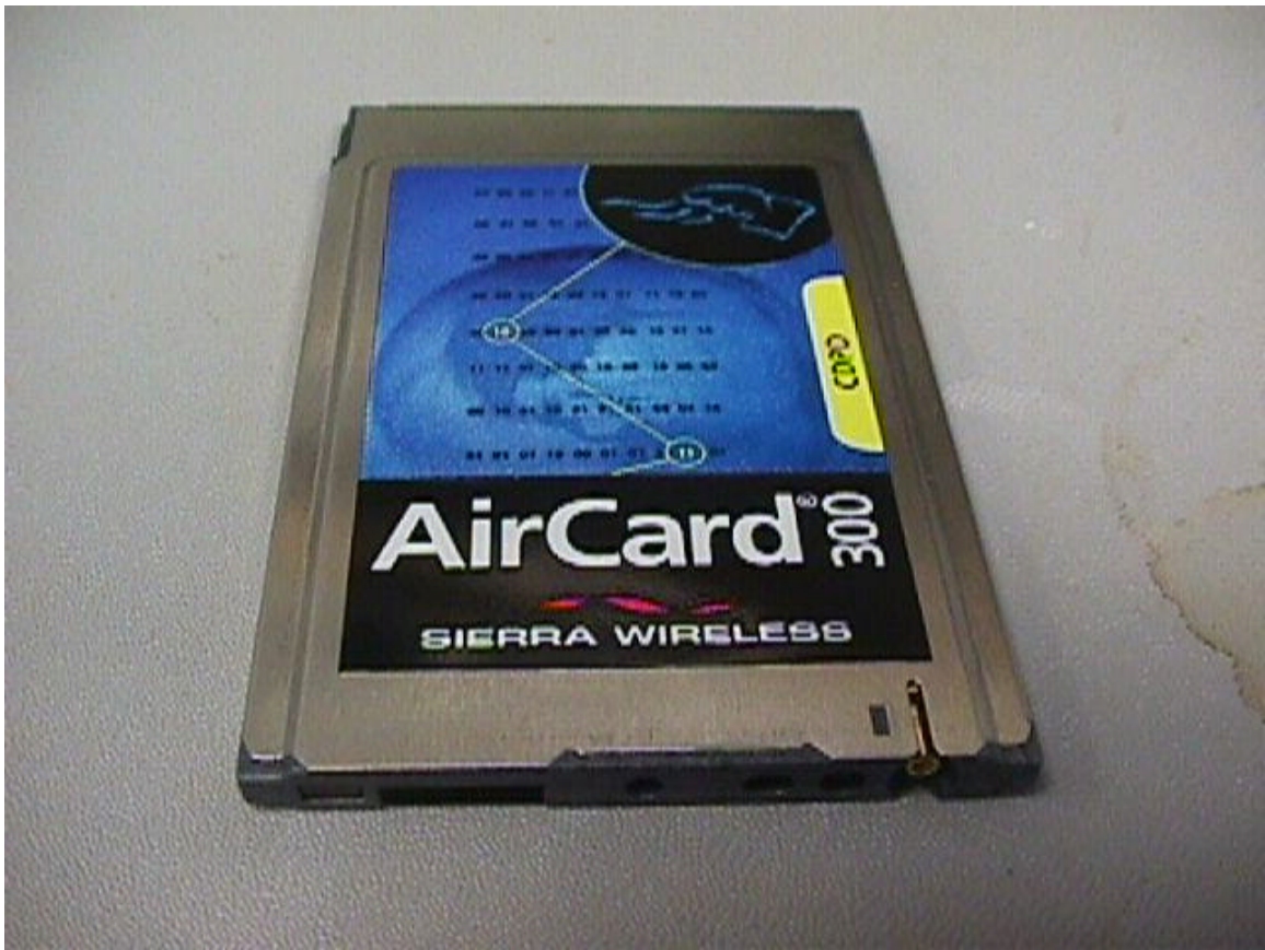
Figure 1: PCMCIA Card Edge – Outside edge showing antenna connector