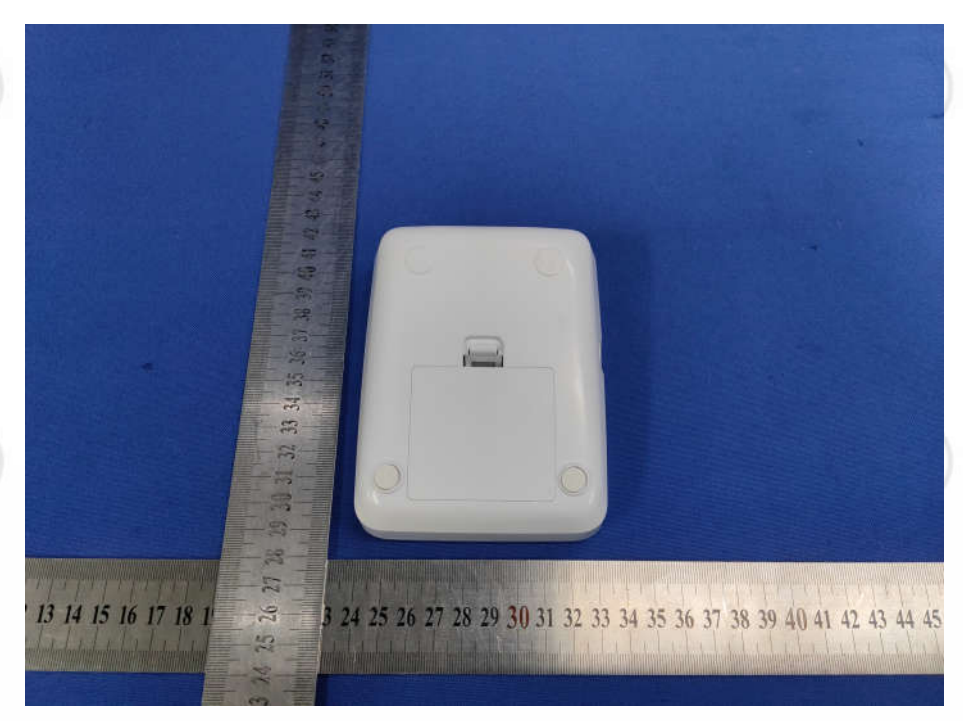
View of Product-07

Report No.: EED32Q80790001 Page 38 of 42