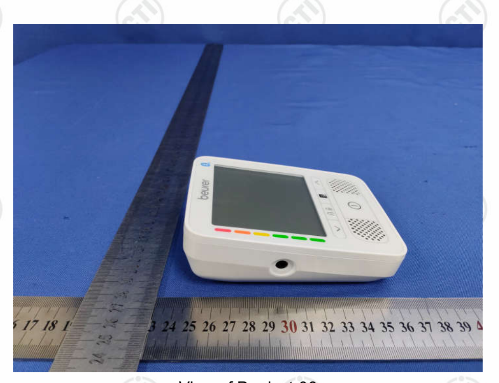
View of Product-06