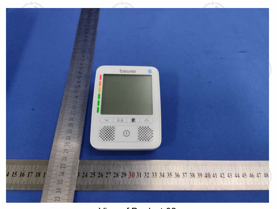
View of Product-02