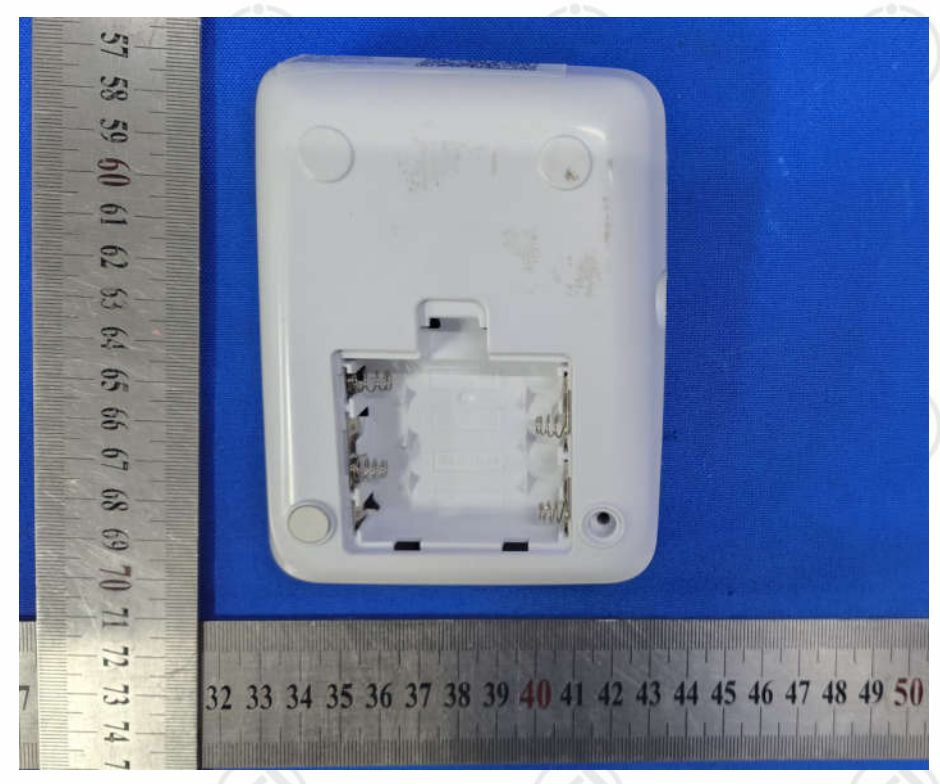
View of Product-08