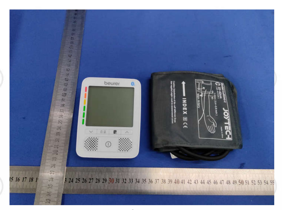
View of Product-01