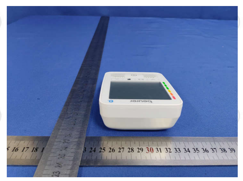
View of Product-05

Page 37 of 42 Report No.: EED32Q80790001