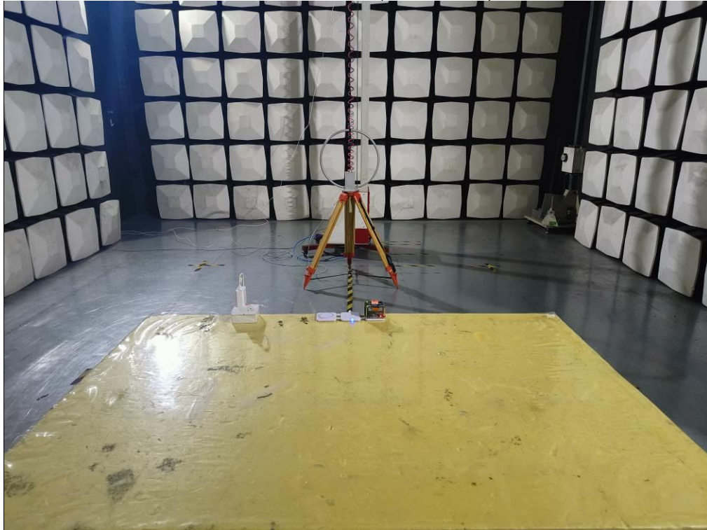
Test Photo Radiated emission (Below 30MHz)