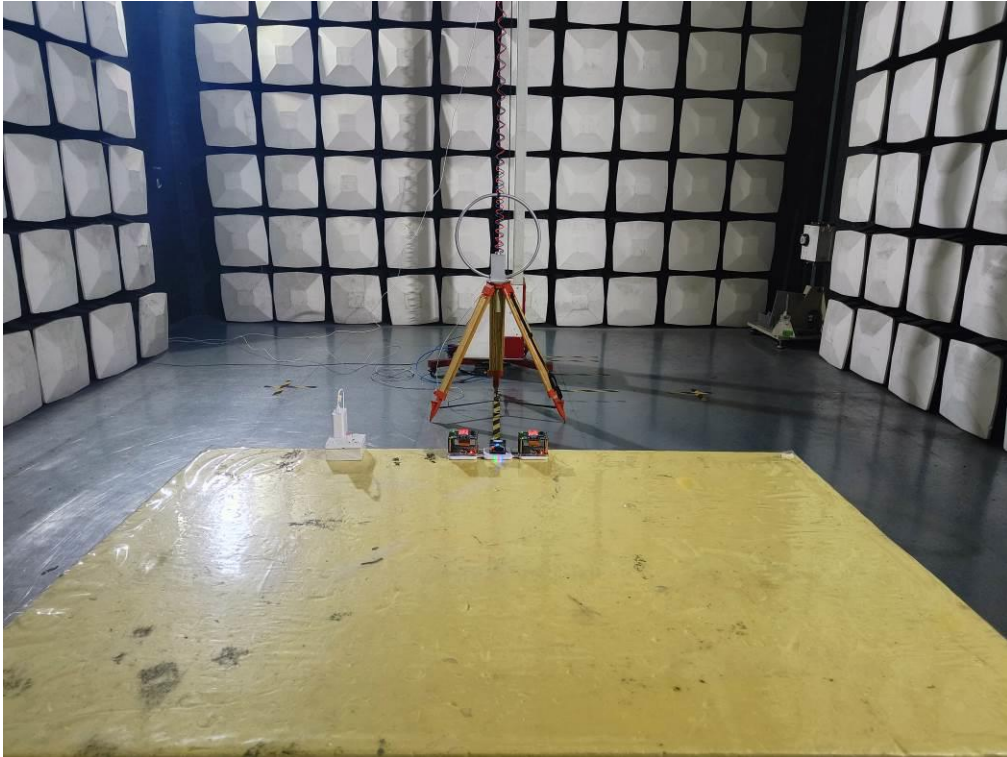
Radiated emission (30-1000MHz)