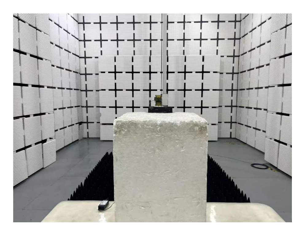
Set-up for Radiated Spurious Emission, Above 1GHz

Set-up for Radiated Spurious Emission, Below 1GHz