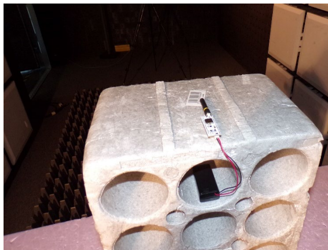
Measurements above 1GHz (FAC)