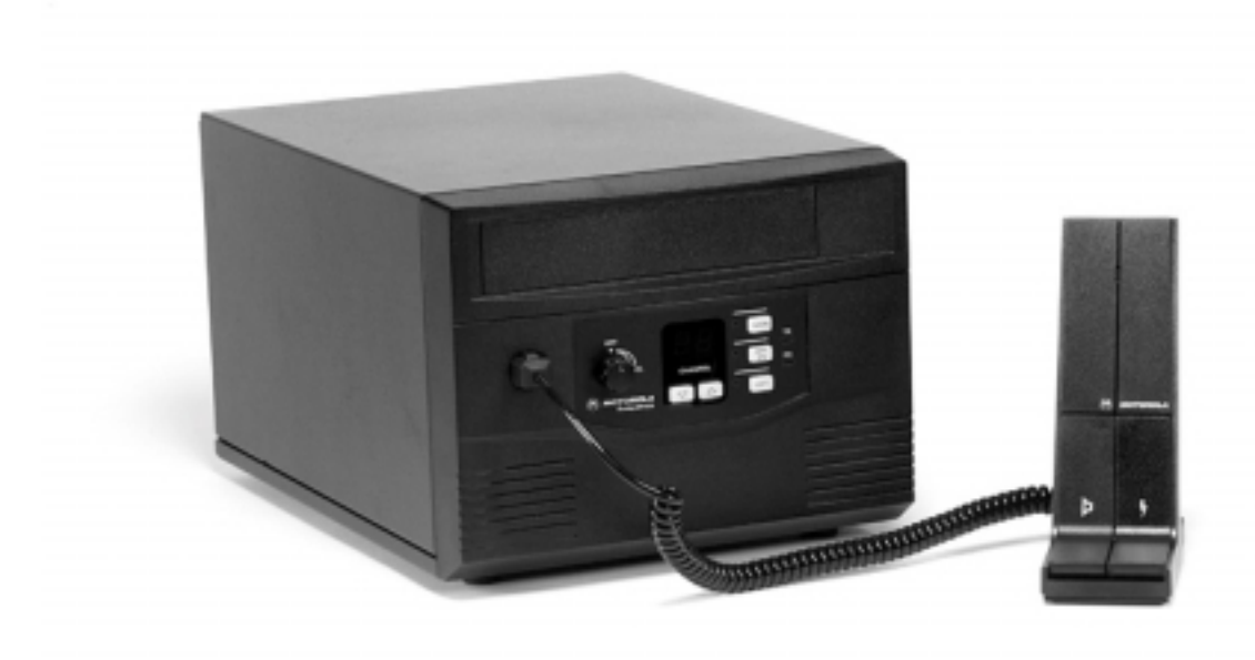
TRANSCEIVER ASSEMBLED INTO OPTIONAL HOUSING WITH DESK MICROPHONE