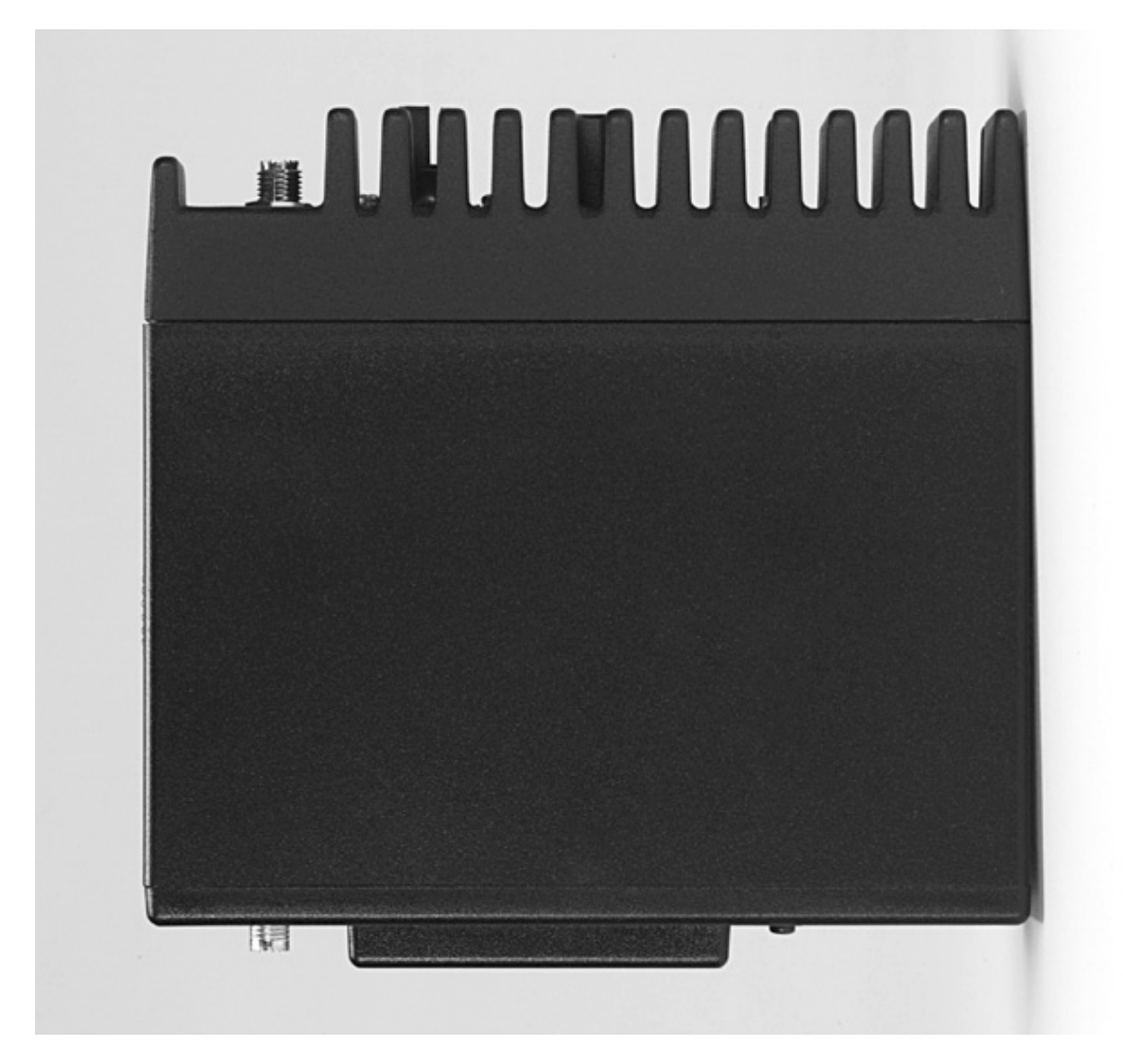
TRANSCEIVER TOP VIEW WITH TOP COVER