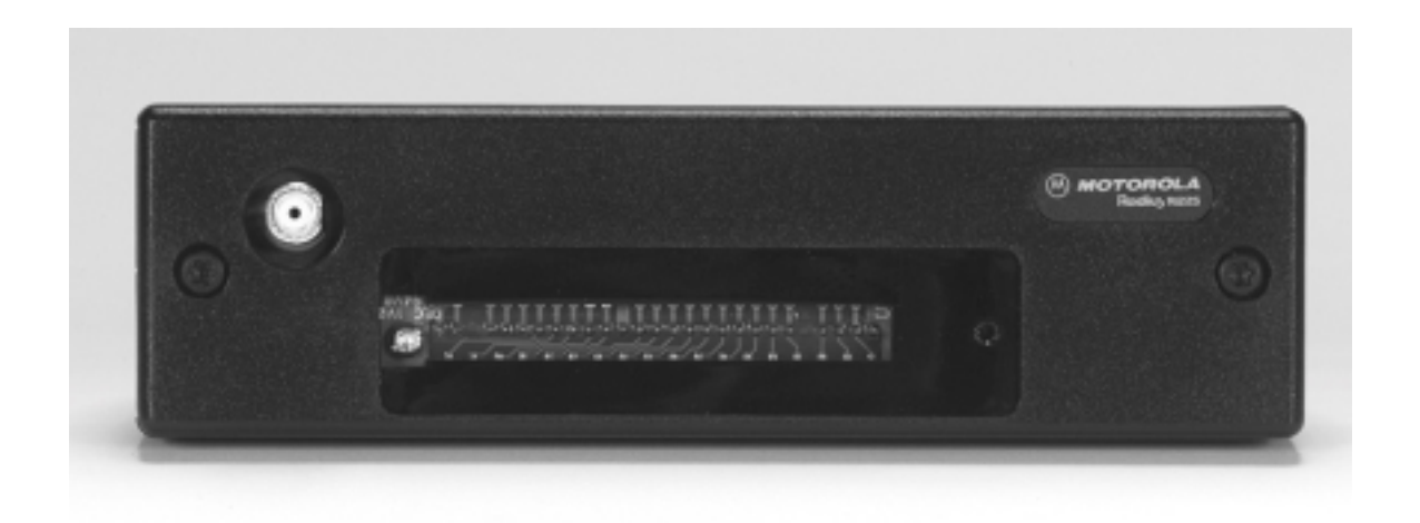
TRANSCEIVER FRONT VIEW WITHOUT CONNECTOR COVER