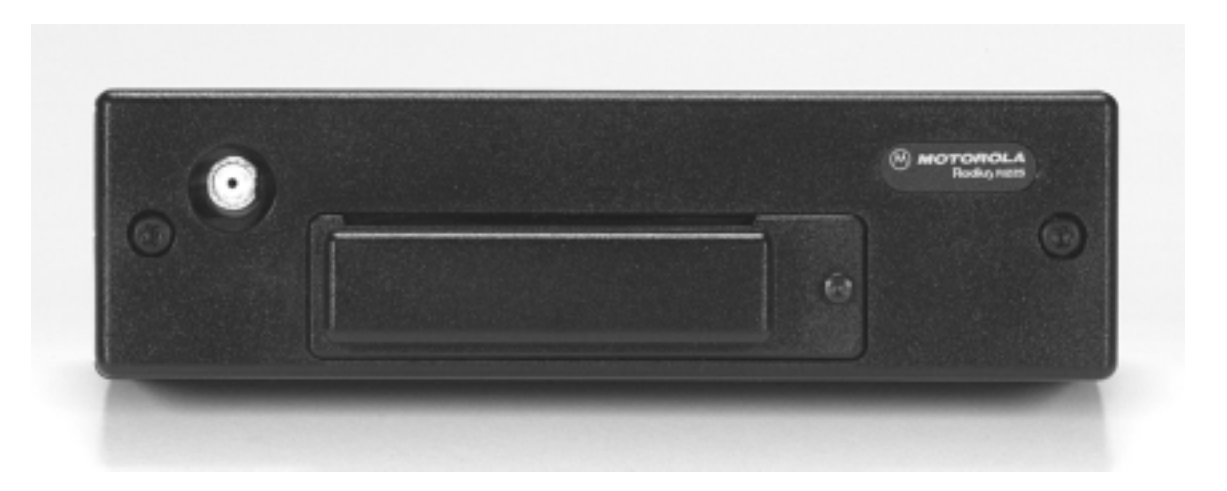
TRANSCEIVER FRONT VIEW WITH FRONT COVER