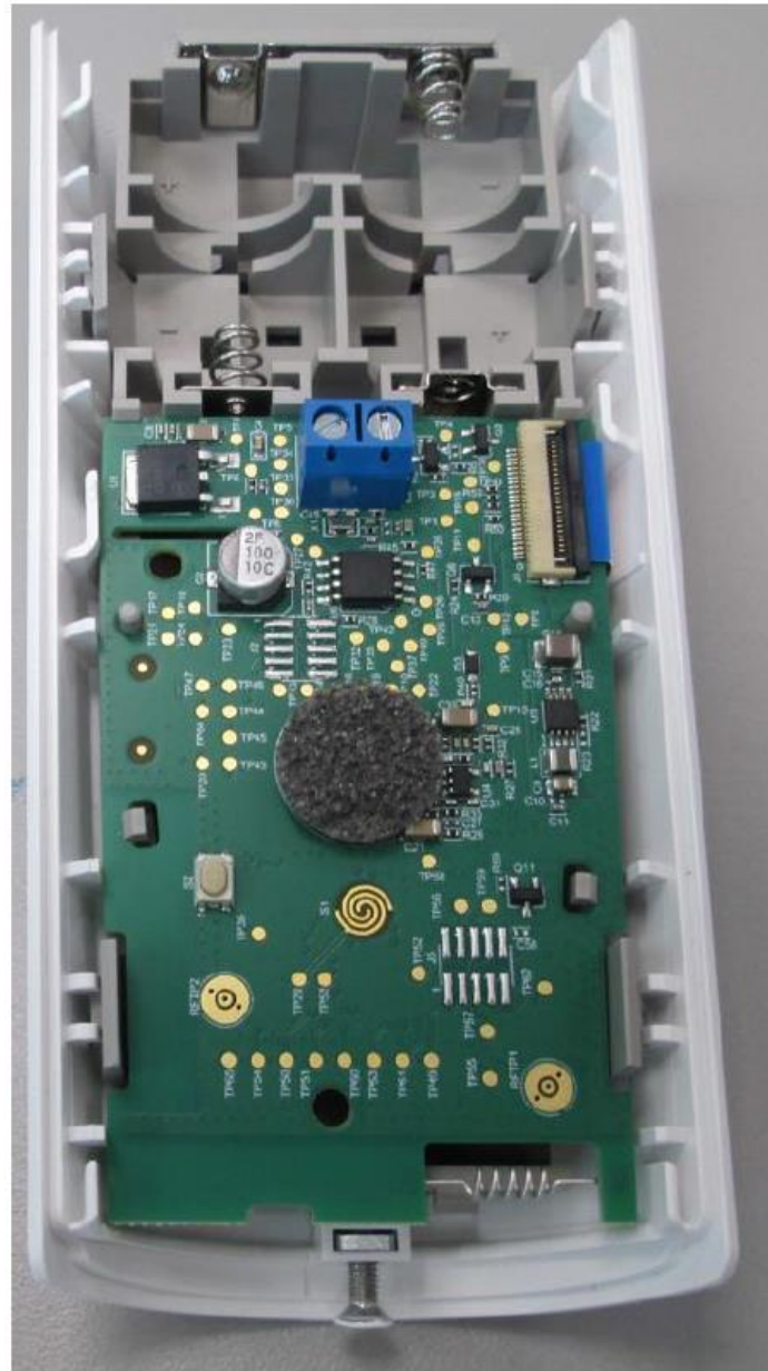
Photograph No.1 Wireless Motion detector with integrated camera PCB Main Board (front side)