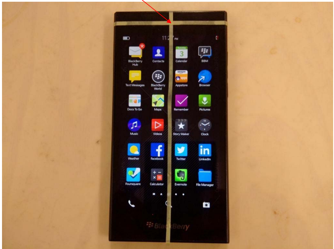
Figure C1. BlackBerry Smartphone