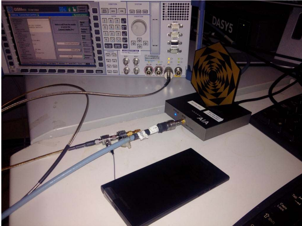
Figure C2 – MIF measurement setup