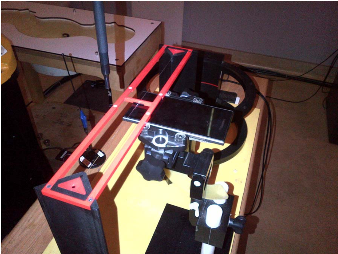
Figure C4 – HAC RF emissions test setup