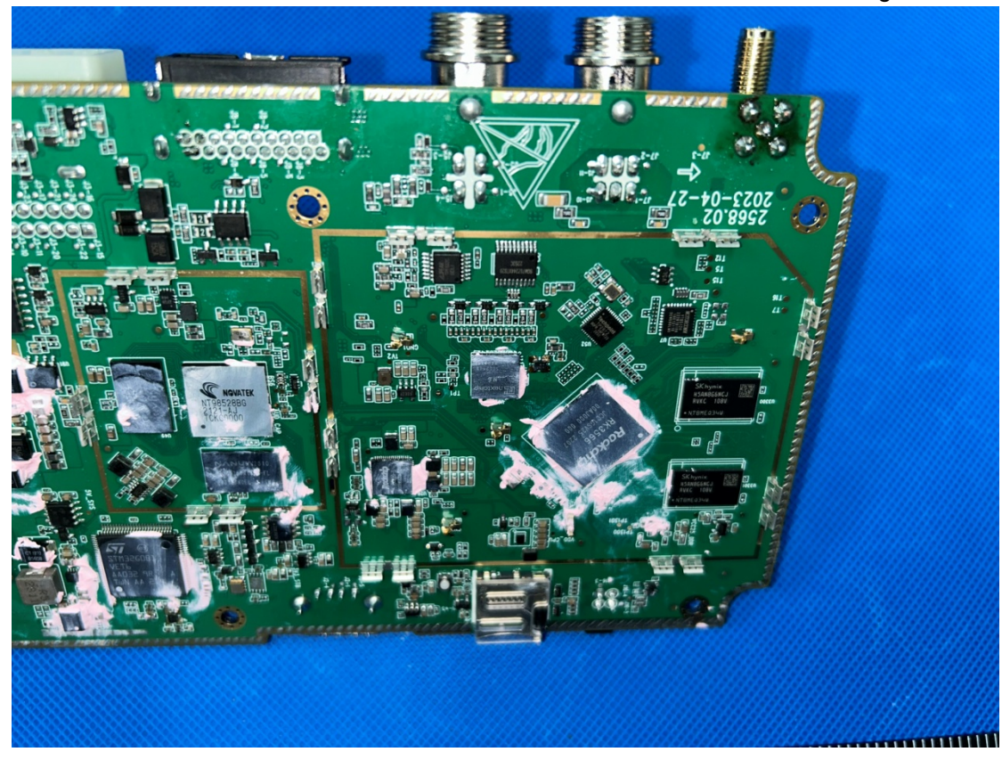
Page 5 of 5