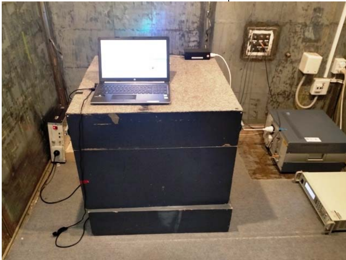
Conducted emissions test setup