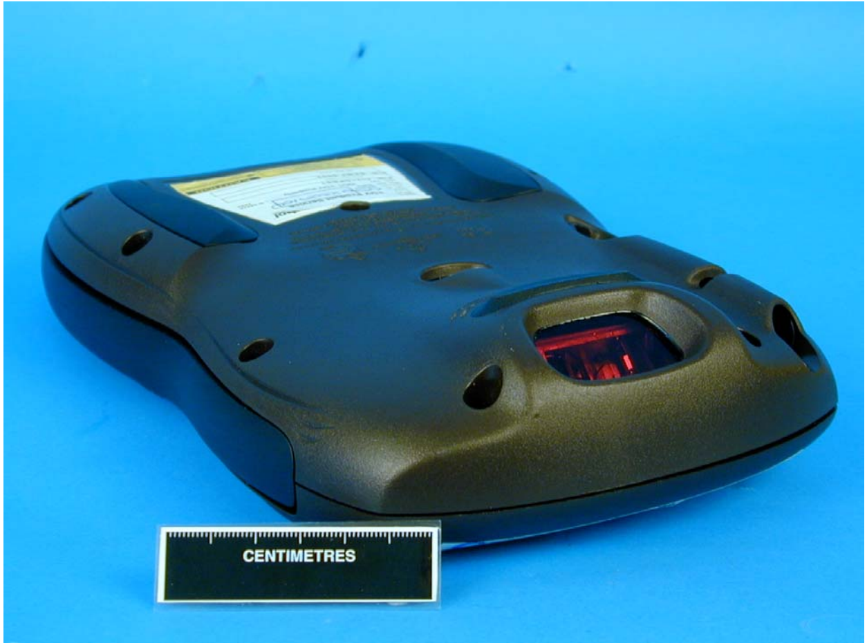
Right Hand Side View