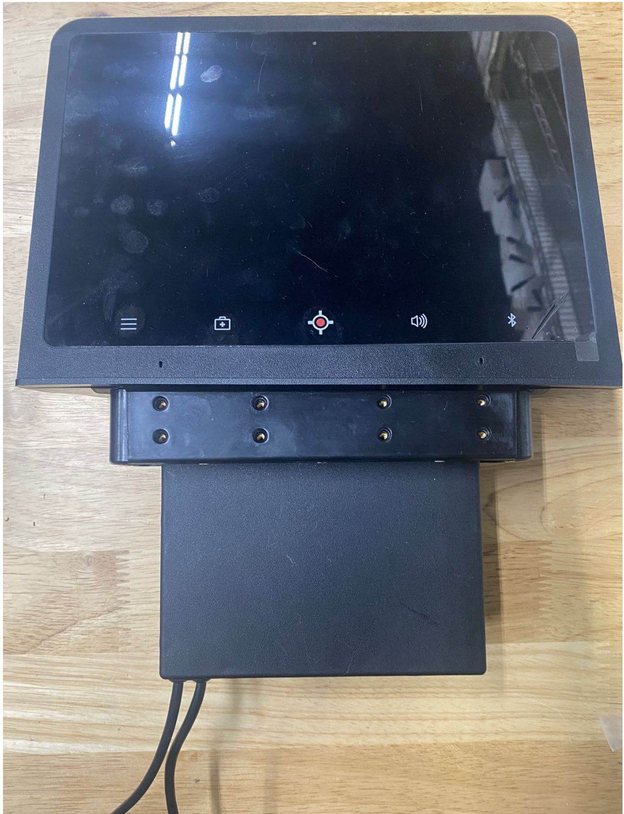
Product Front View: