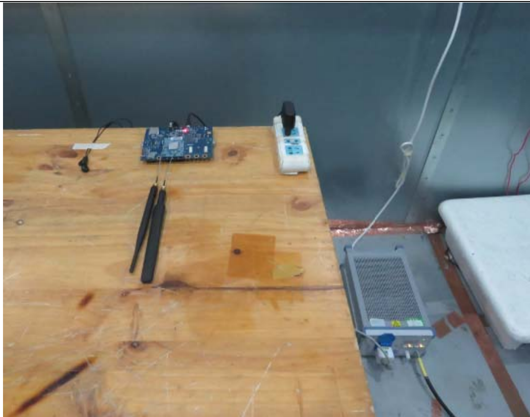
Picture 2 Conducted Emission Test Setup