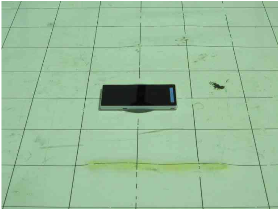
– X-axis –