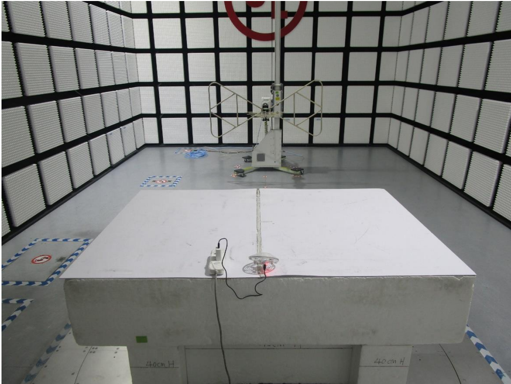
Radiated Disturbance below 30 MHz