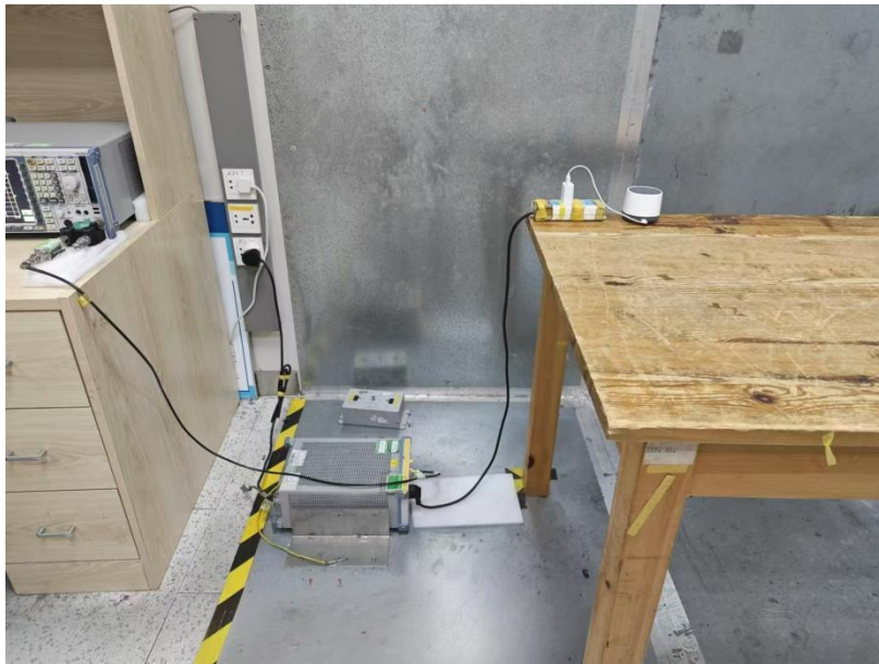
Radiated Emissions From 30M-1GHz