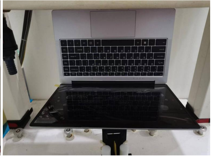
Fig-4.6 Bottom of EUT with 0 cm Gap (Body Mode)