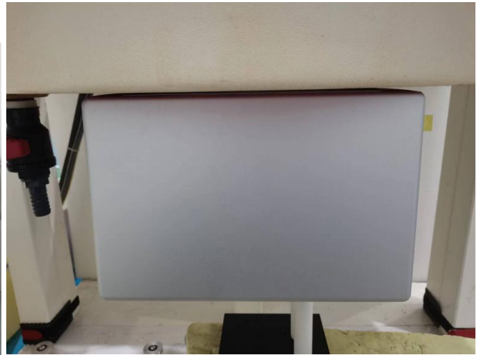
Fig-4.2 Rear Face of EUT with 0 cm Gap (Body Mode)