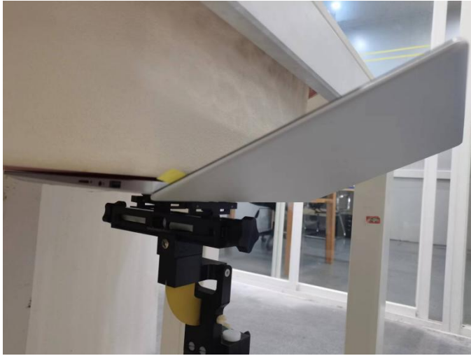
Fig-4.1 Front of EUT with 0 cm Gap (Body Mode)