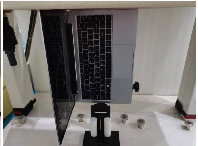
Fig-4.4 Right Side of EUT with 0 cm Gap (Body Mode)