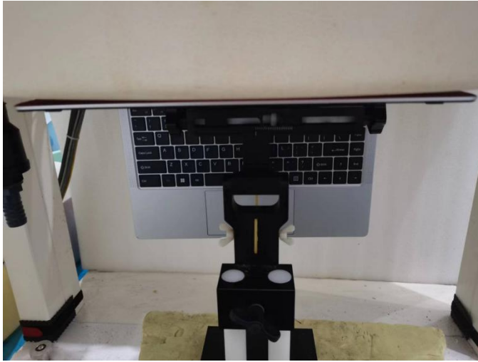
Fig-4.5 Top of EUT with 0 cm Gap (Body Mode)