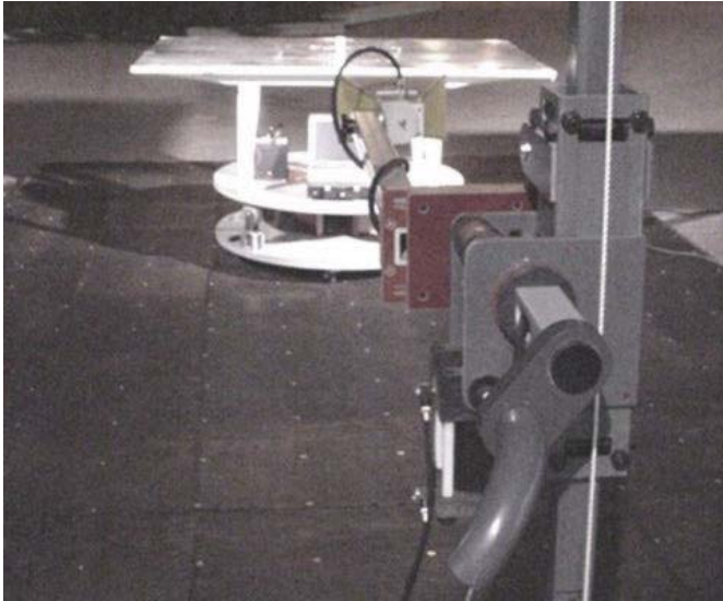
Radiated Measurement Test Setup