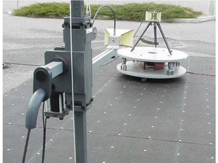
Signal Substitution Test Setup