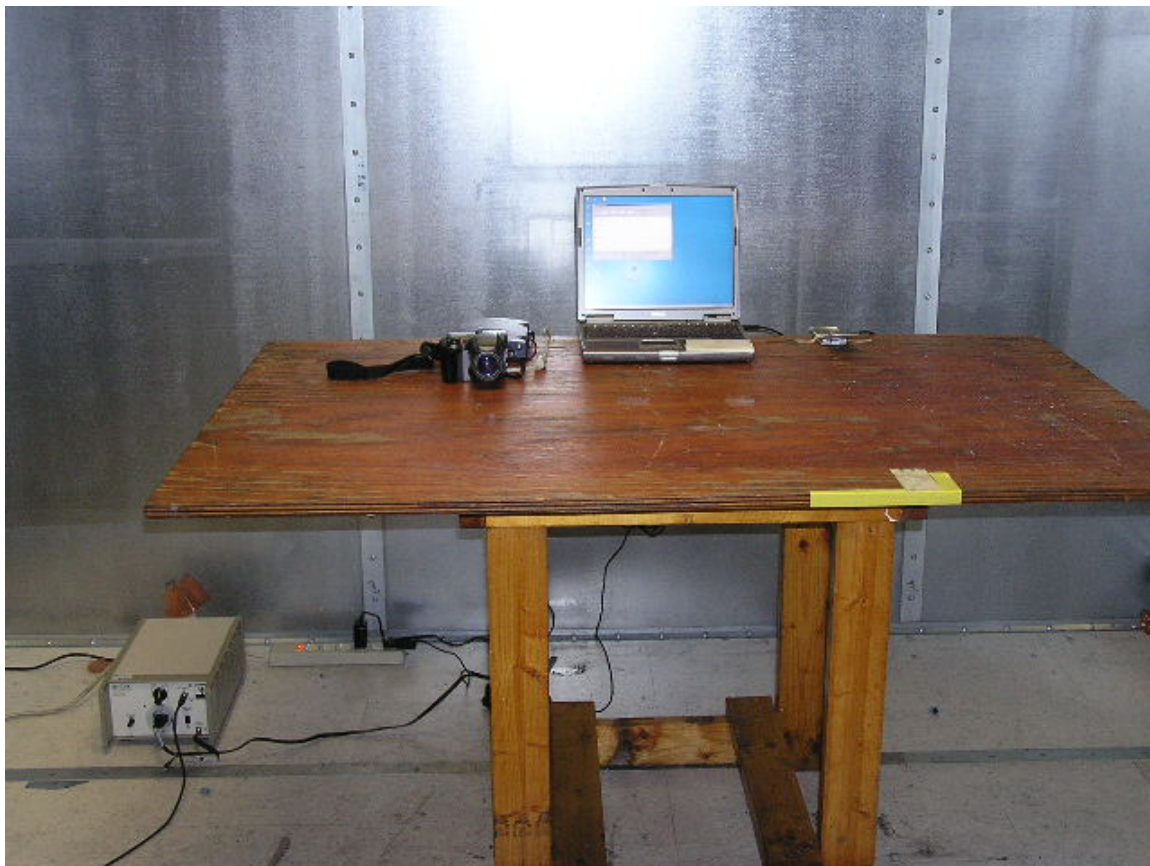
AC Line Conducted Emissions Measurement Setup. (Representative Photo- Not Actual Phone Tested)