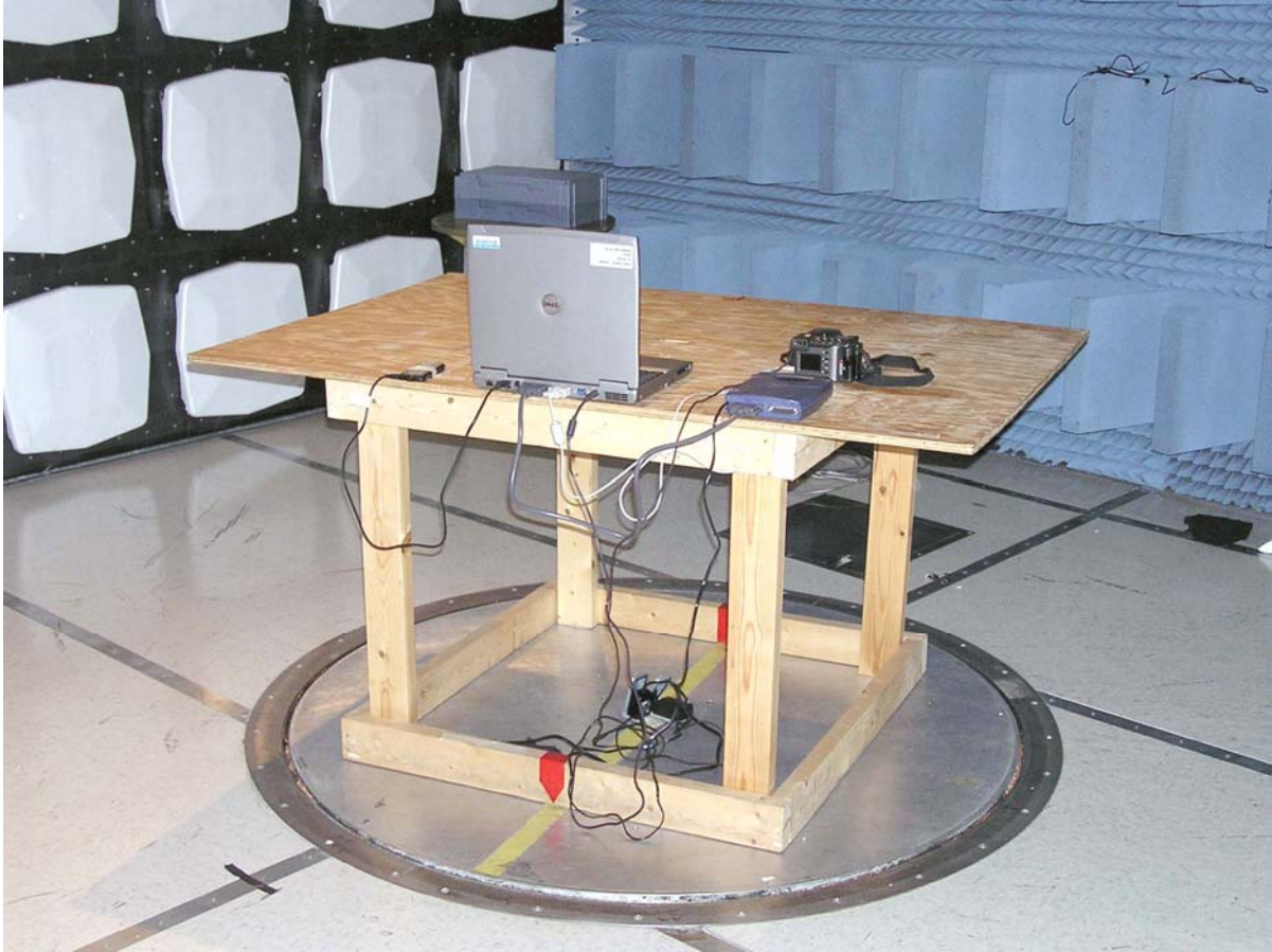
Radiated Emissions Measurement Setup (Representative Photo – Not Actual Phone Tested)