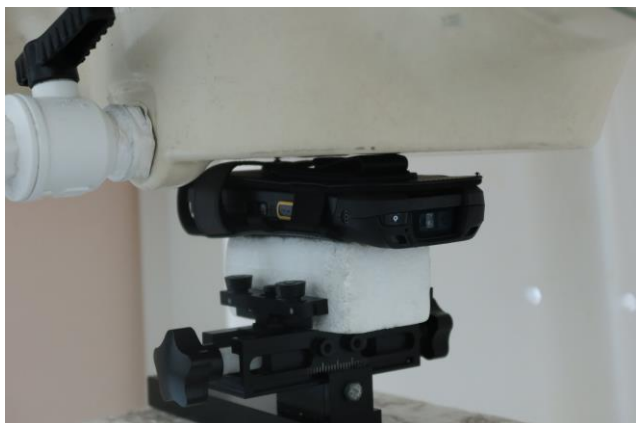
Front with Soft Holster at 0 mm