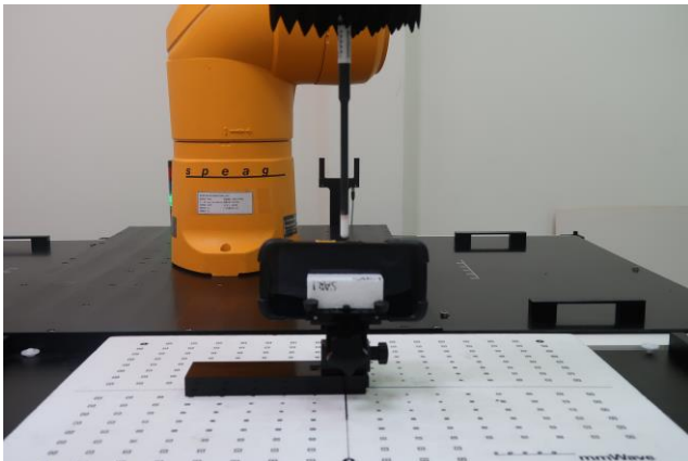
Right Side at 2 mm