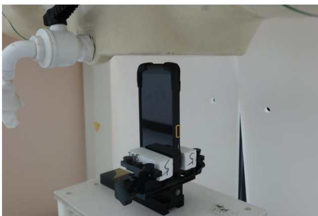
Bottom Side at 10 mm