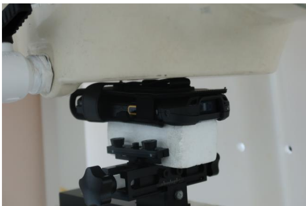
Back with Soft Holster at 0 mm