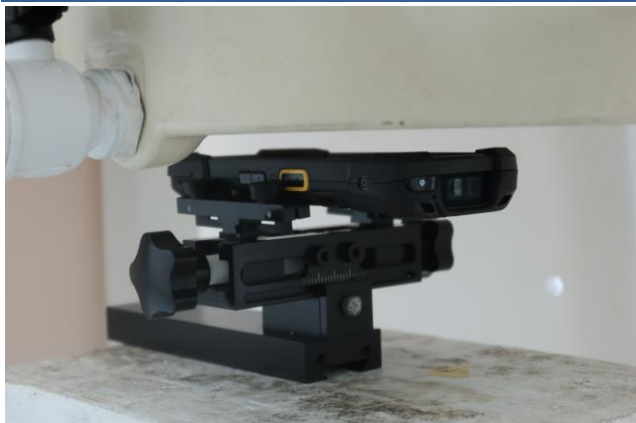
Front at 10 mm