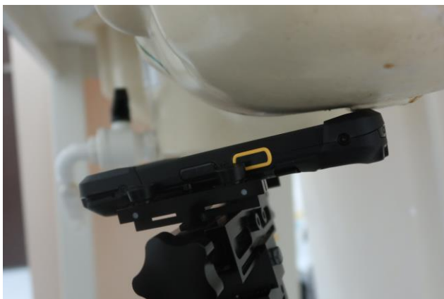
Left Tilted at 0mm