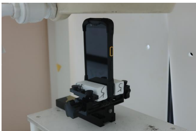
Top Side at 10 mm