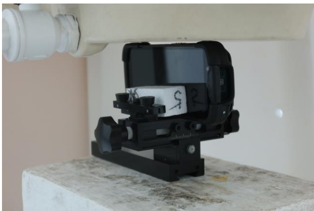
Left Side at 0 mm