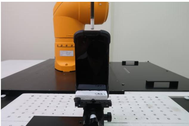
Top Side at 2 mm