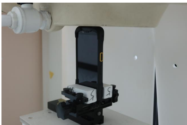
Top Side at 0 mm