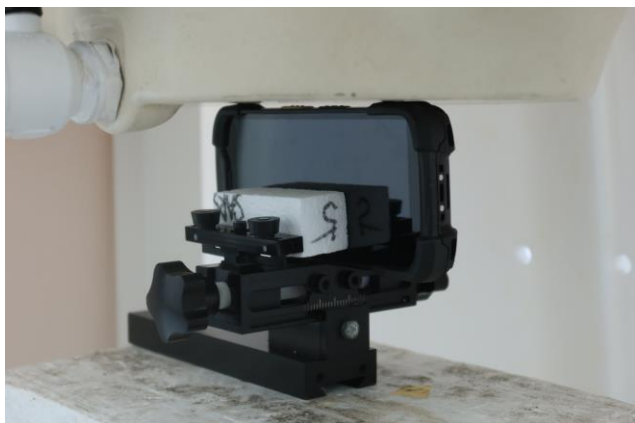
Right Side at 0 mm