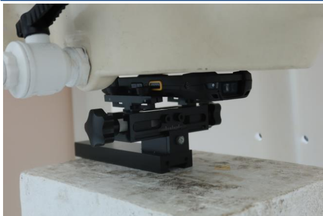
Front at 0 mm