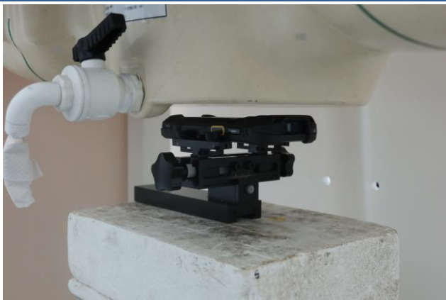
Back at 10 mm