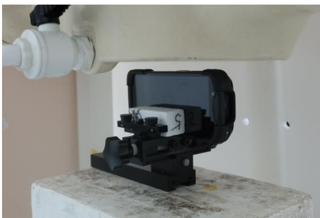
Left Side at 10 mm