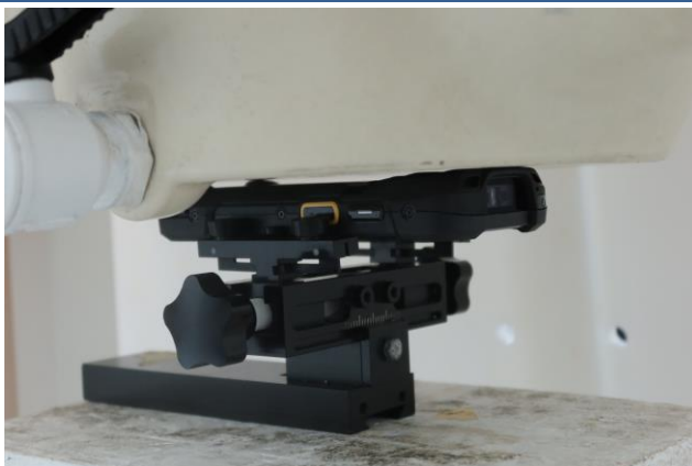
Back at 0 mm