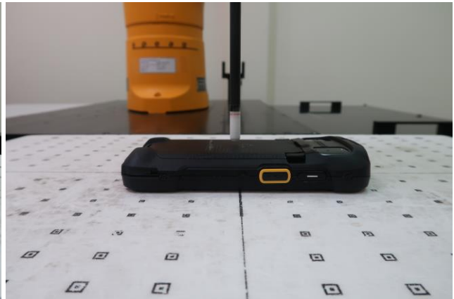
Back at 2 mm