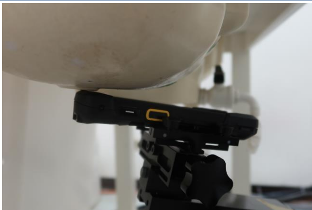
Right Tilted at 0mm