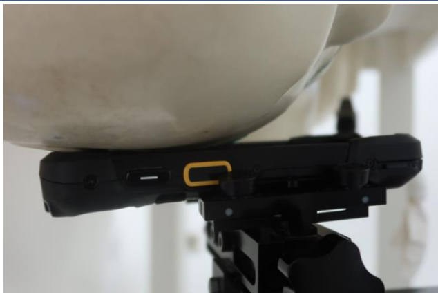
Right Cheek at 0mm