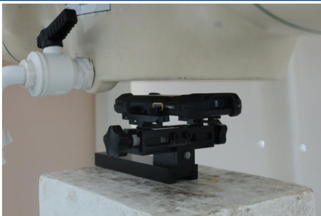
Back at 15 mm