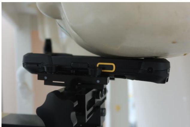
Left Cheek at 0mm