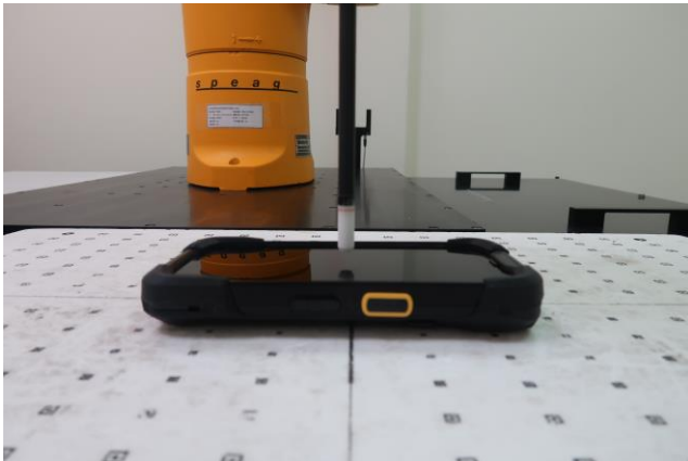
Front at 2 mm