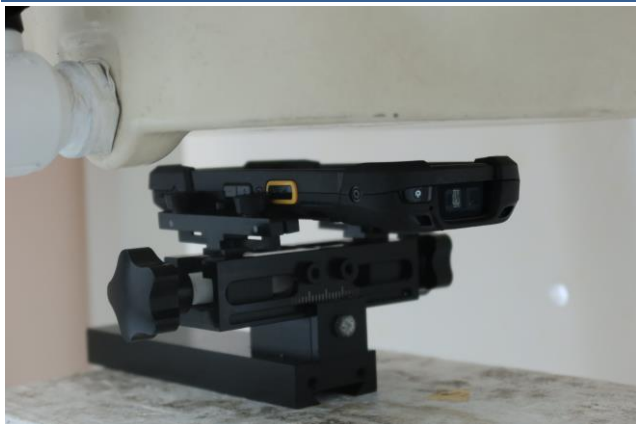
Front at 15 mm