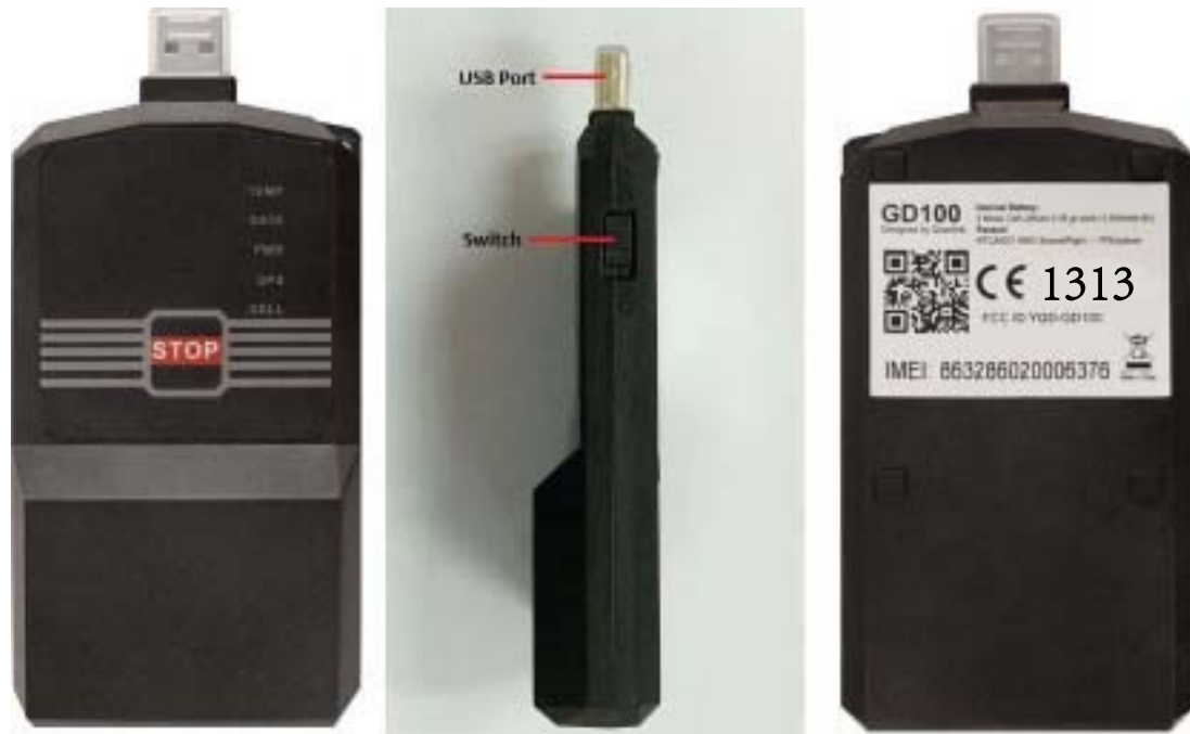
Figure 1. Appearance of GD100