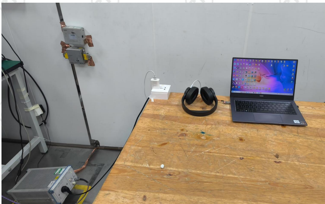
AC Power Line Conducted Emissions Test Setup