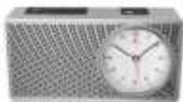
The Robin Unit