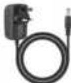
Power Cable and Transformer Box plug