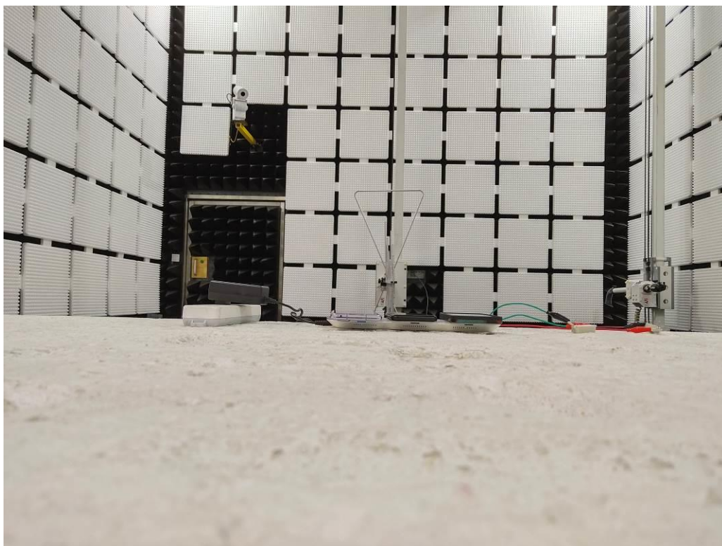
Radiated Emission below 1GHz