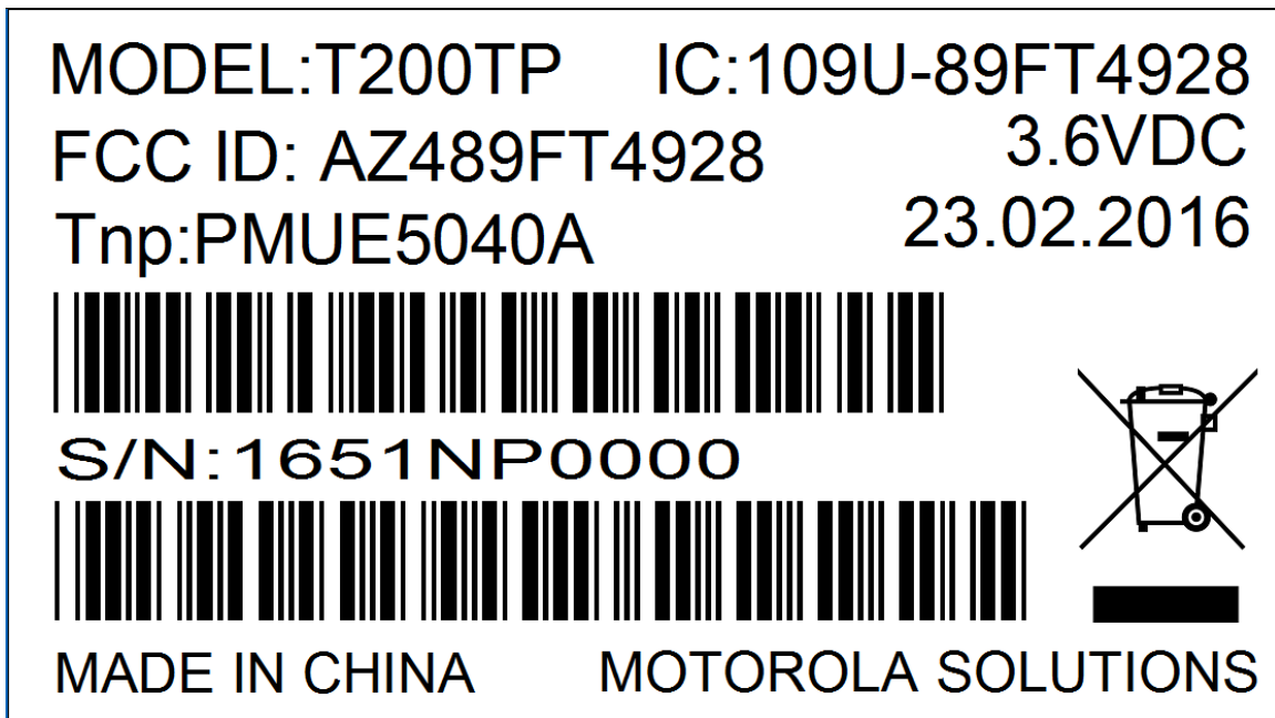
Figure 2: FCC IC Label for Sales model T200TP