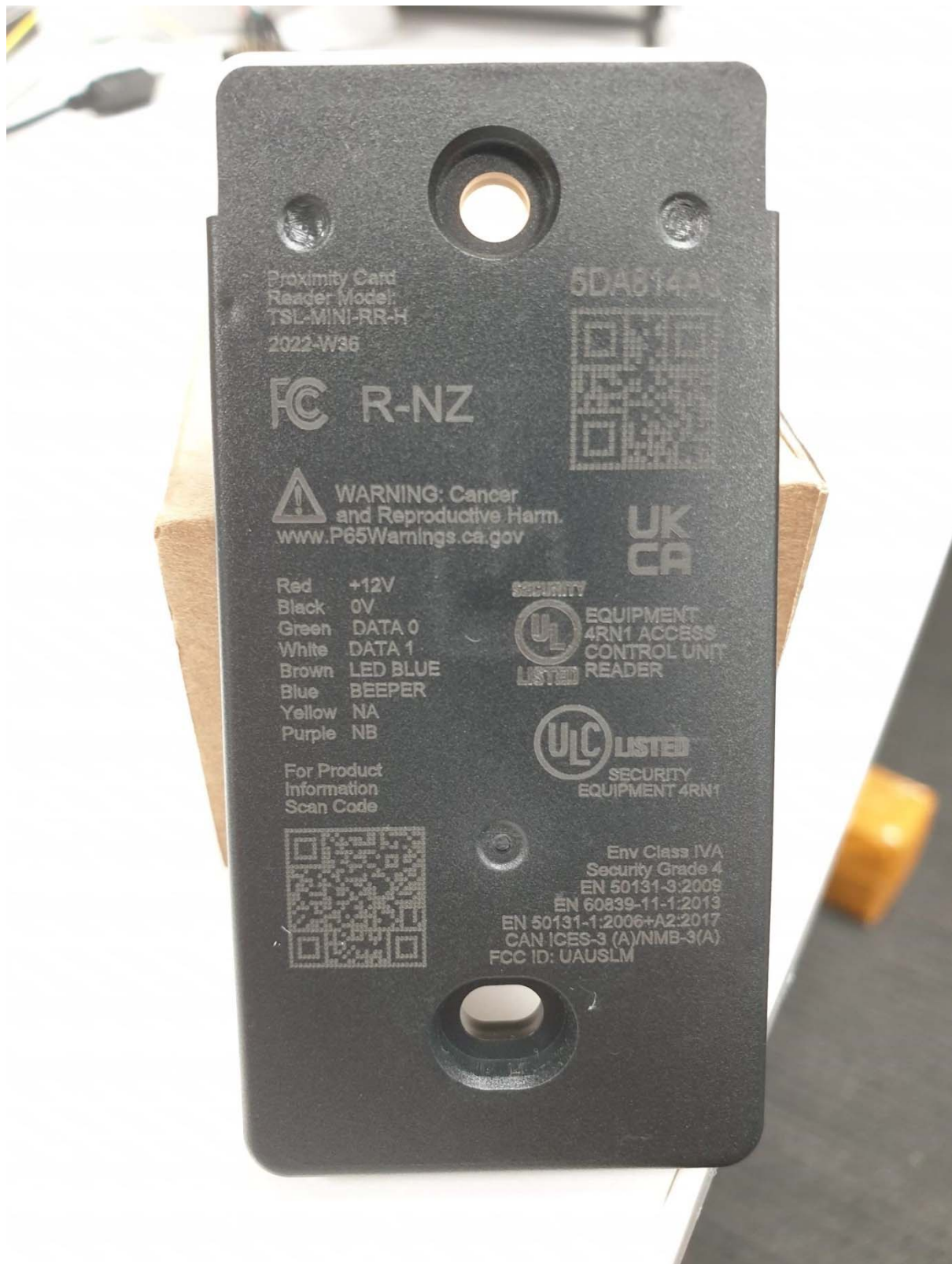
Label on product