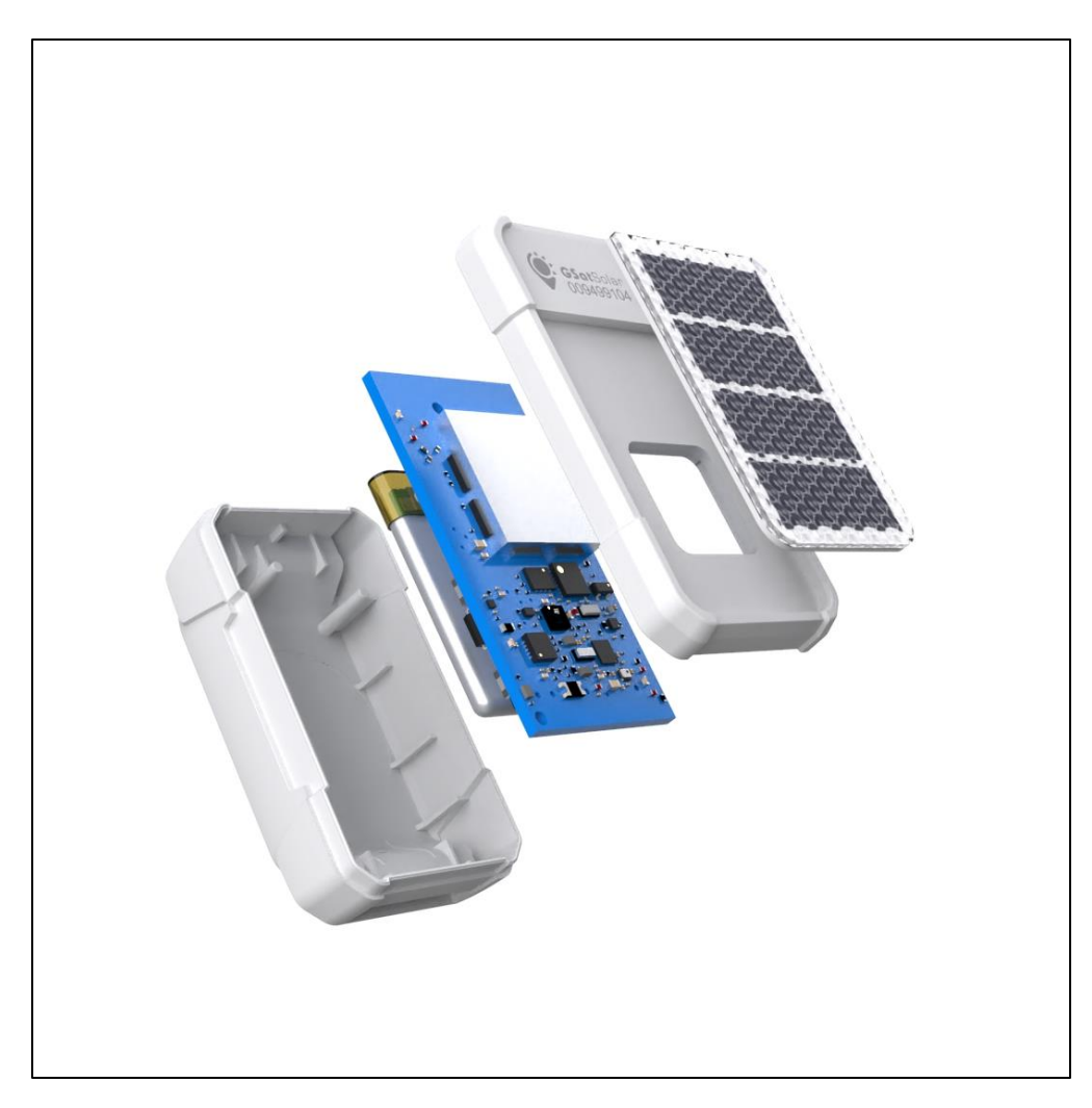
GSatSolar Exploded Internal View Drawing