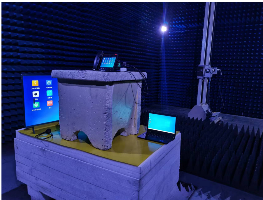
Photo of DFS Measurement