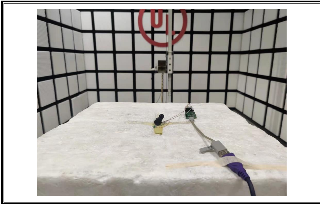
RADIATED RF MEASUREMENT SETUP (Above 1G – Z axis)