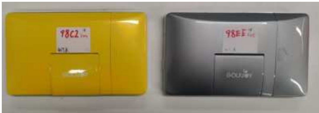
Figure 4 Rear view