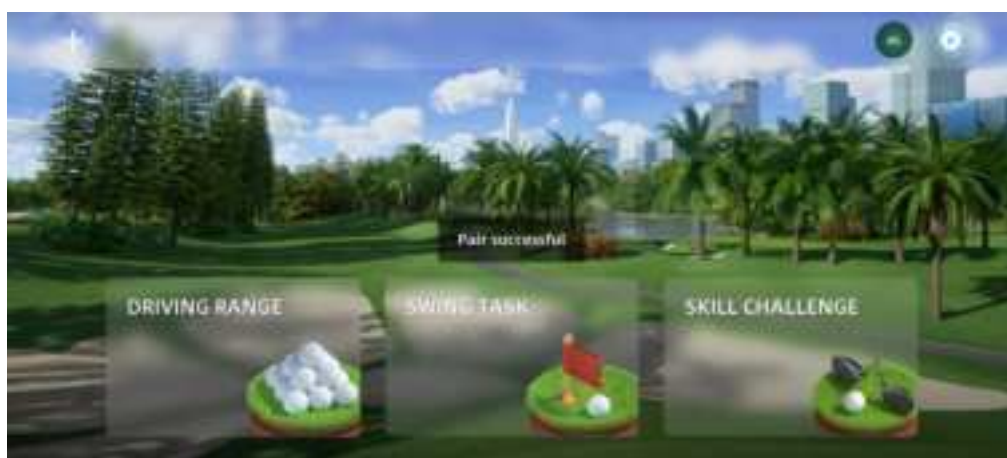
Figure15 Successful connection