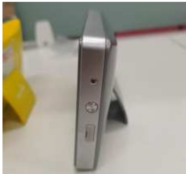
Figure 3 Side view