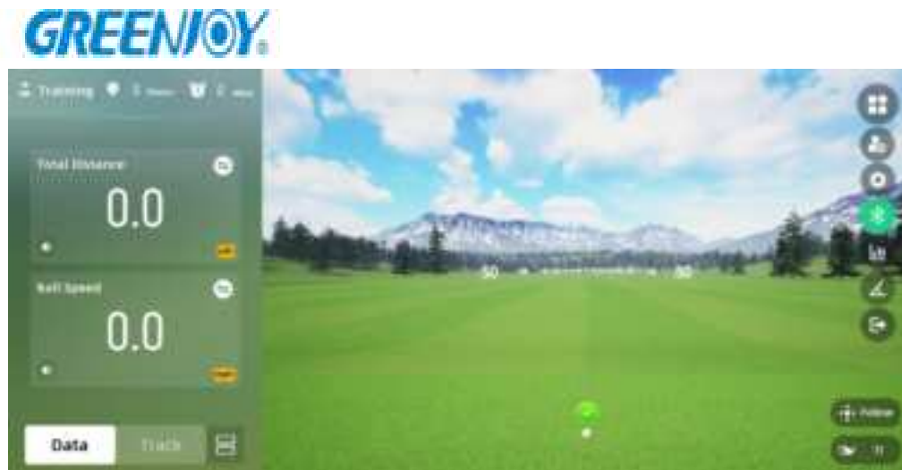
Figure 17 View the motion parameters and trajectory of the golf ball