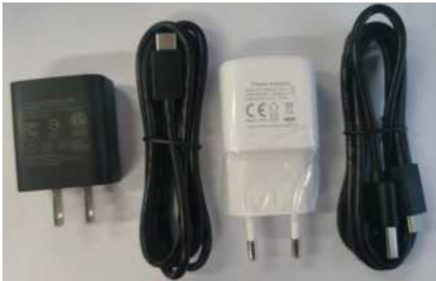
Figure 4 Charger and charging cable