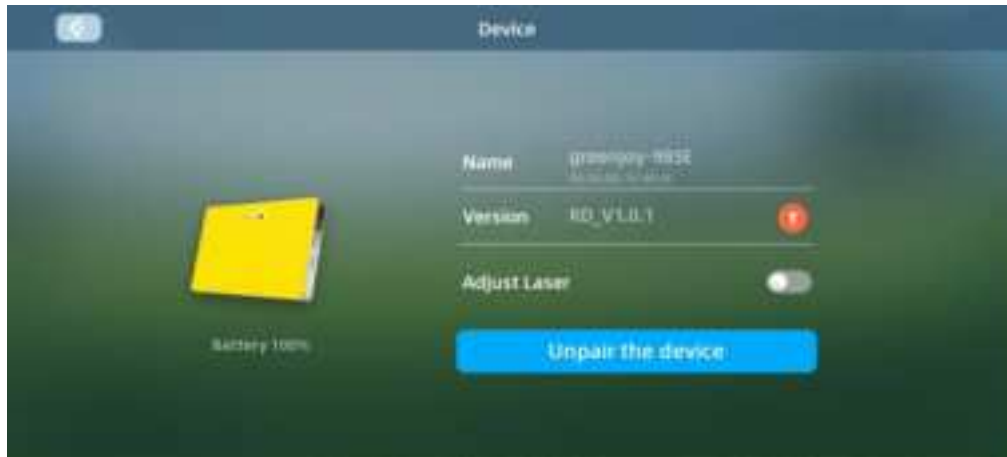
Figure 16 View information about connected devices