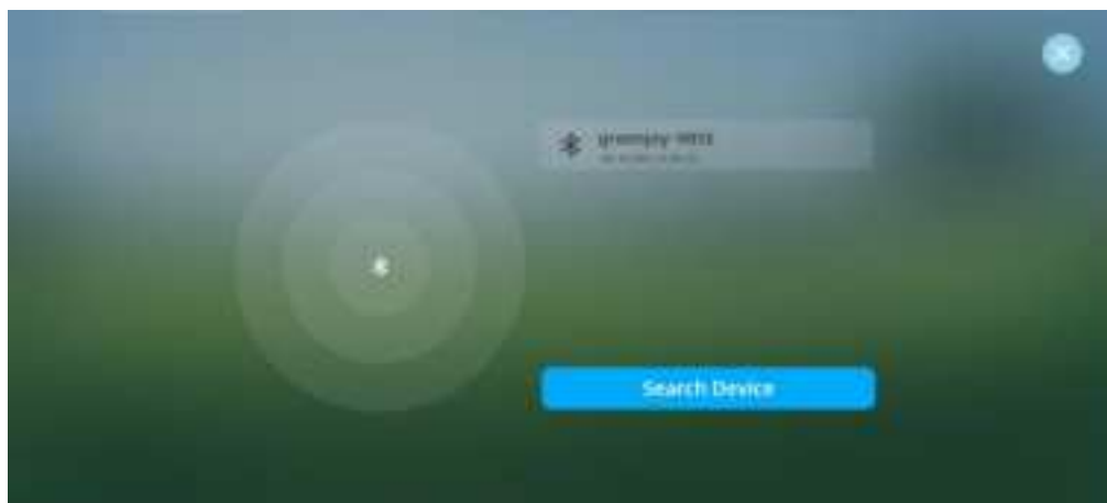
Figure14 Search for a device and click the corresponding device