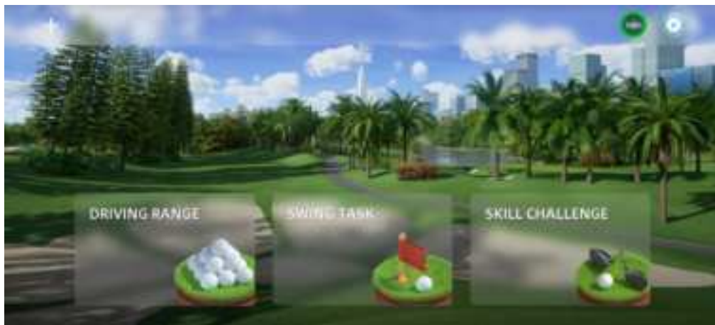
Figure 16 Top right check radar power