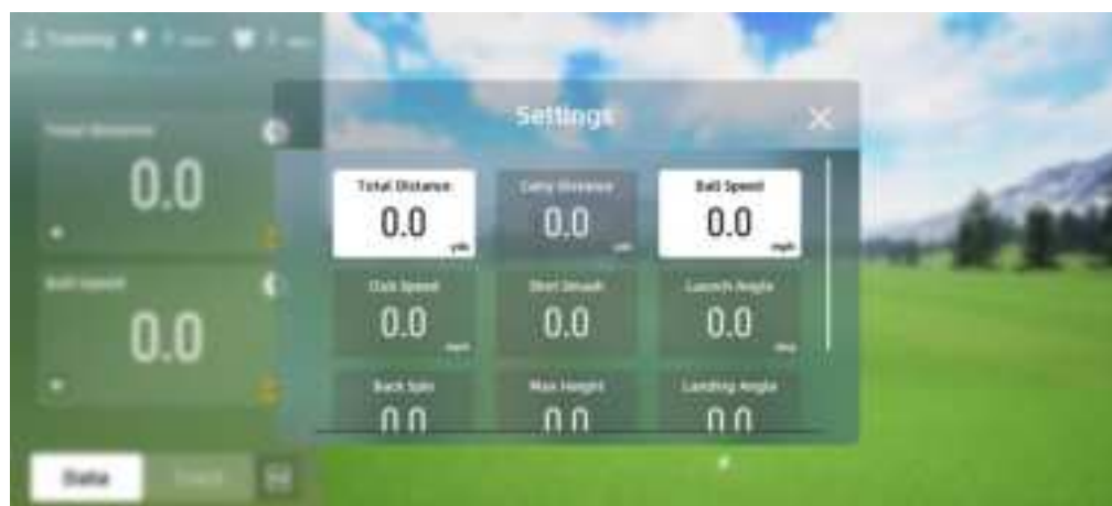
Figure 18 See more motion parameters and trajectories of golf balls