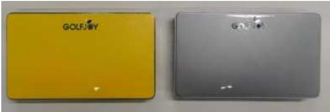
Figure 2 Top view