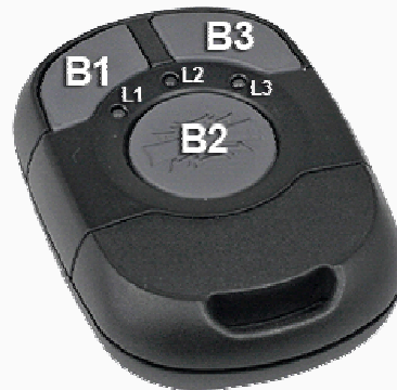
Figure 2: Keyfob control with allocated Buttons and LEDs names

The Keyfob gives you remote operation of your security system. This Keyfob operates with the push of one button or buttons combination. It also gives you direct feedback on its operation with a blinking light as well as with voice prompts, so you can be sure that your security system is operating as you intended. The communication to the Keyfob unit is based on the IEEE 802.15.4 wireless network systems.