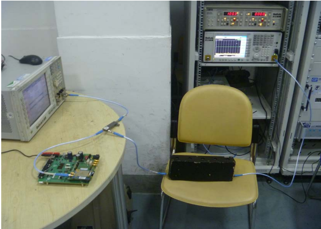
Frequency Stability Under Temperature & Voltage Variations Setup