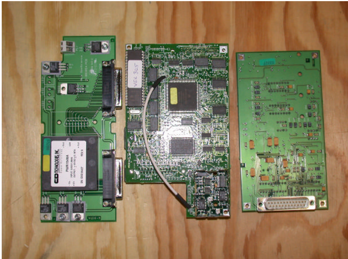
Figure 3. Front side of dc/dc-board(left), cpu-board(middle) and back side of timing board.