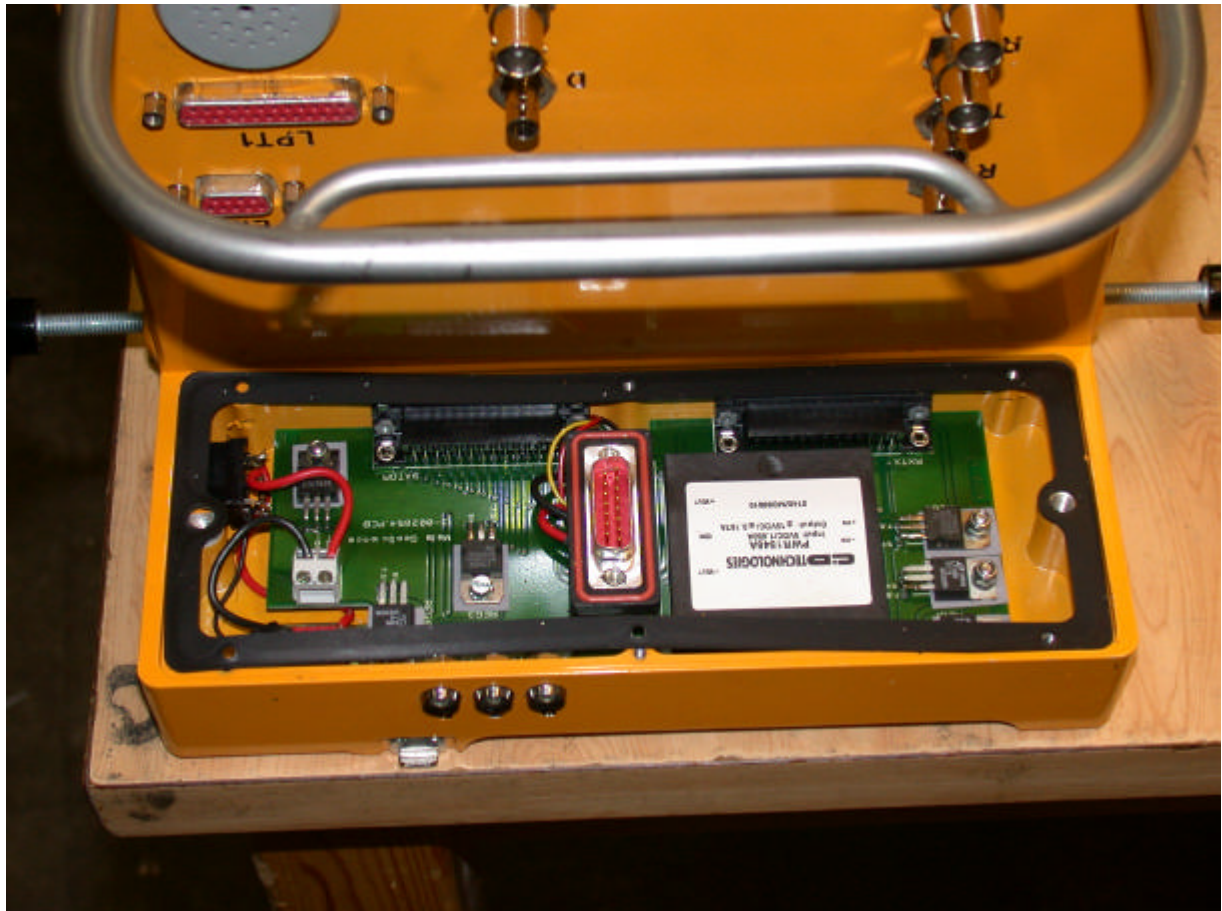
Figure 2. The dc/dc board mounted inside the CUII.