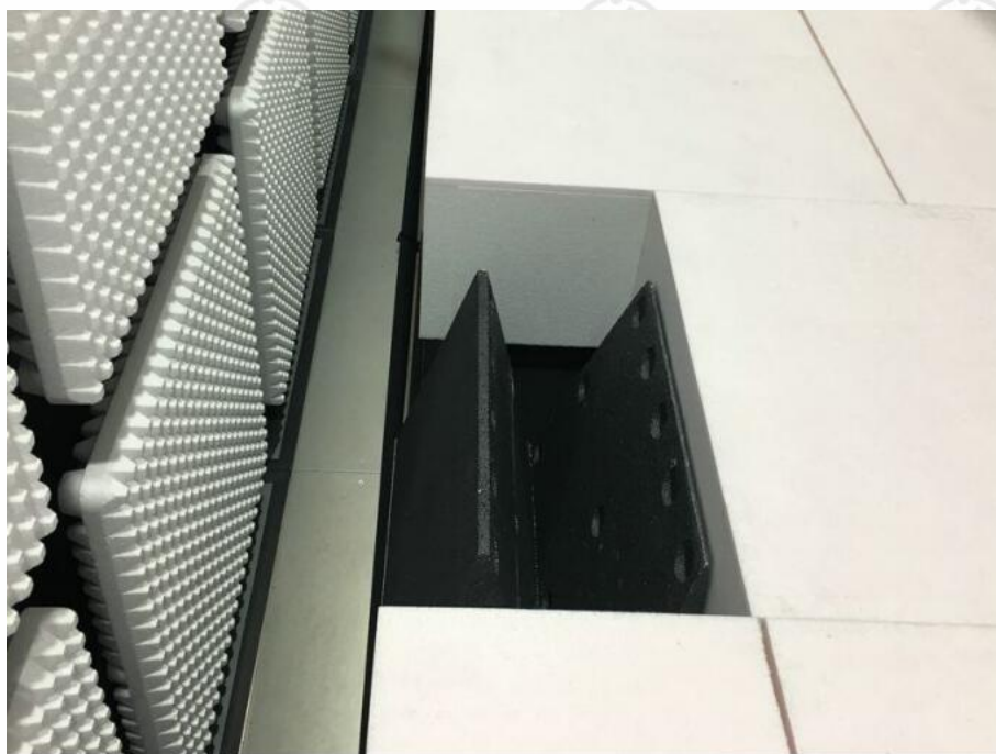
Radiated spurious emission Test Setup-3(Above 1GHz) There are absorbing materials under the ground.