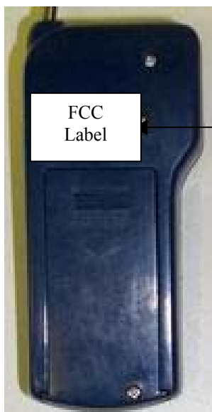
Figure 2.2 Location of Label on Back of the EUT