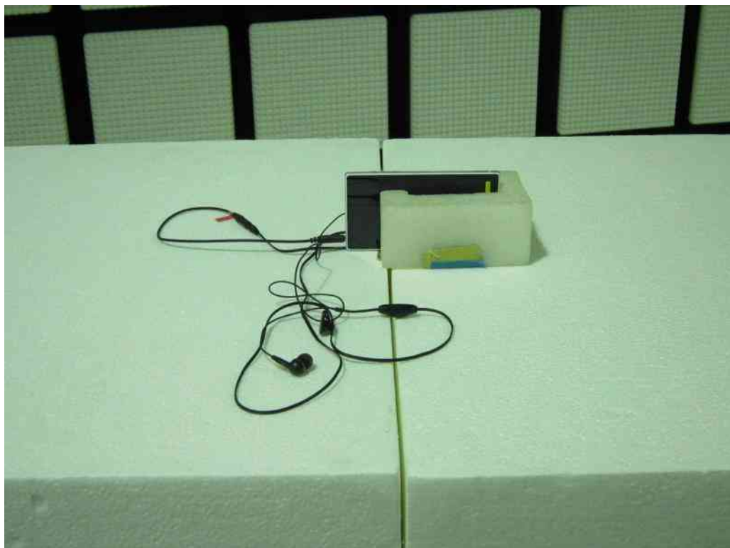
– Y-axis –