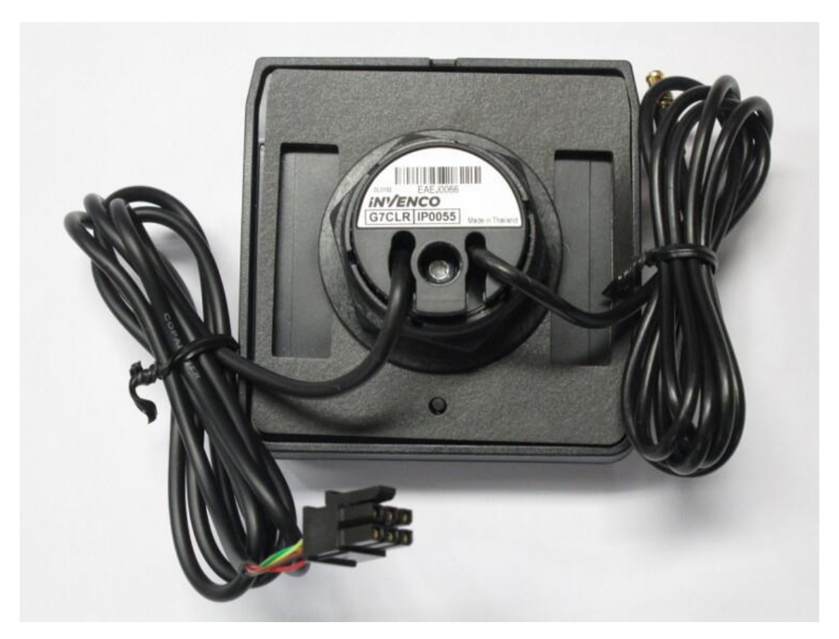
Figure 3 Rear of G7 NFC Antenna