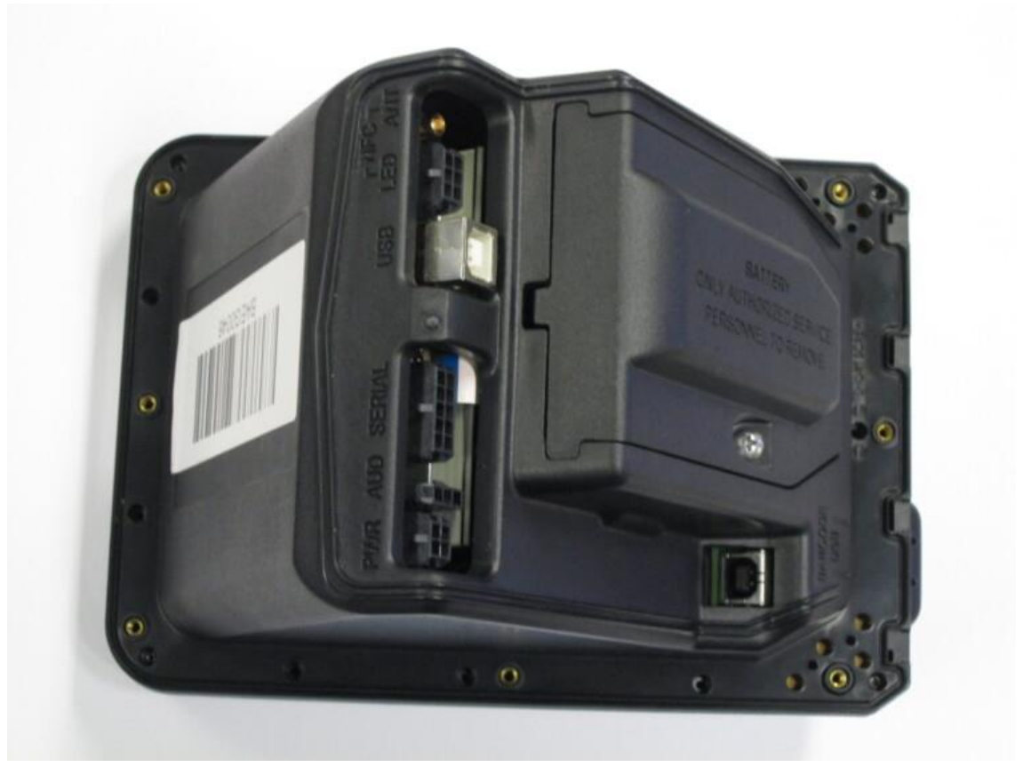
Figure 2 Rear of G7 UPC module