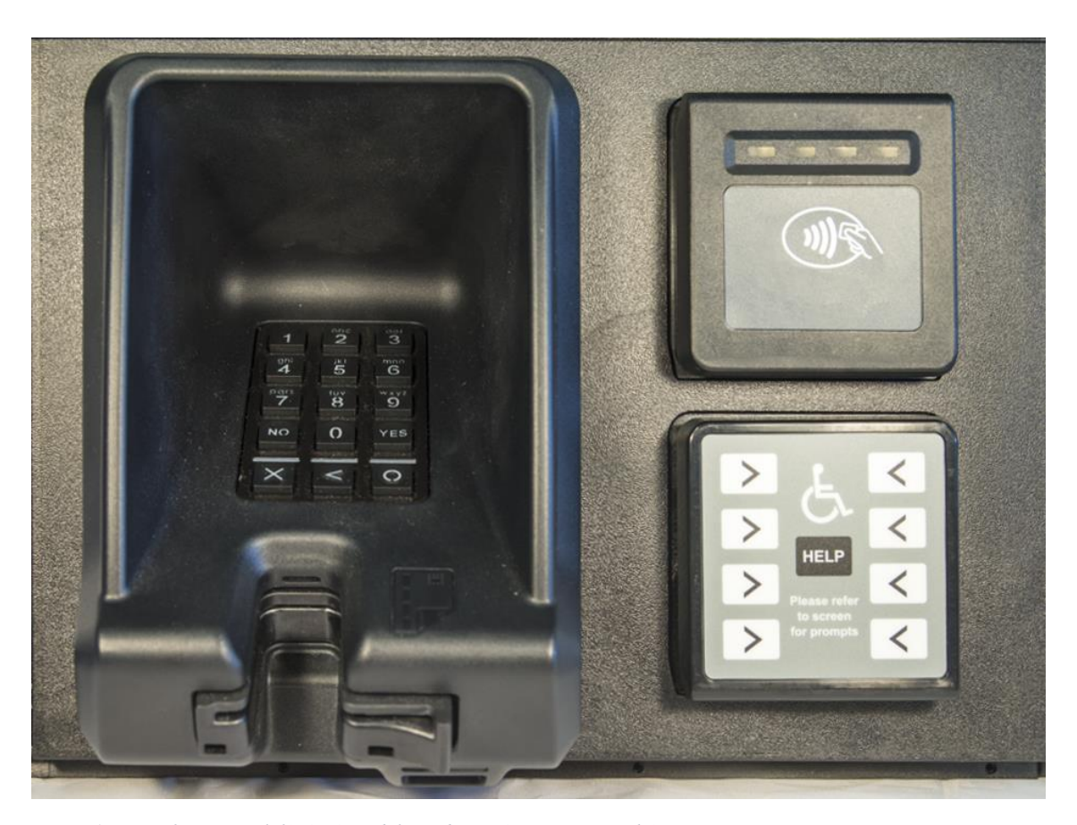
Figure 1 Front of G7 UPC (left), ADA module, and NFC Antenna (top right)