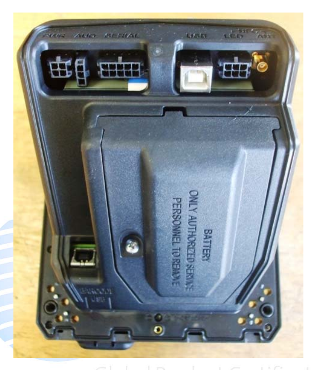
Antenna connector and coax