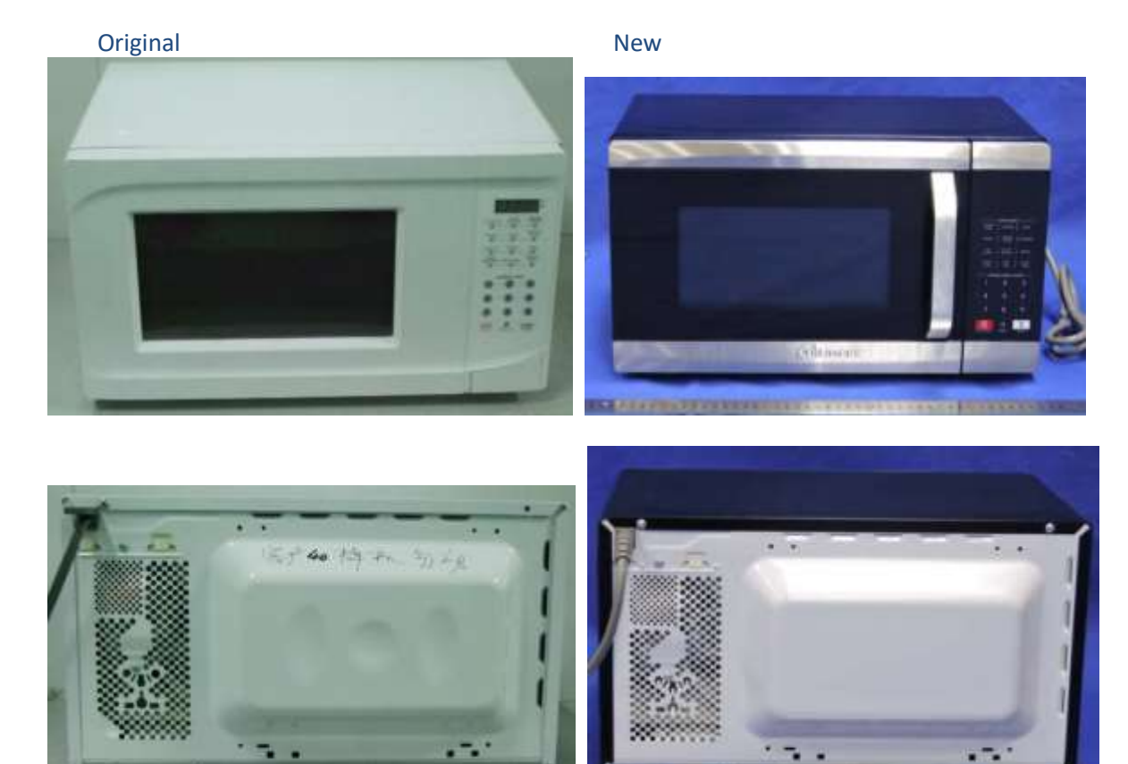
All Others is the same as before.