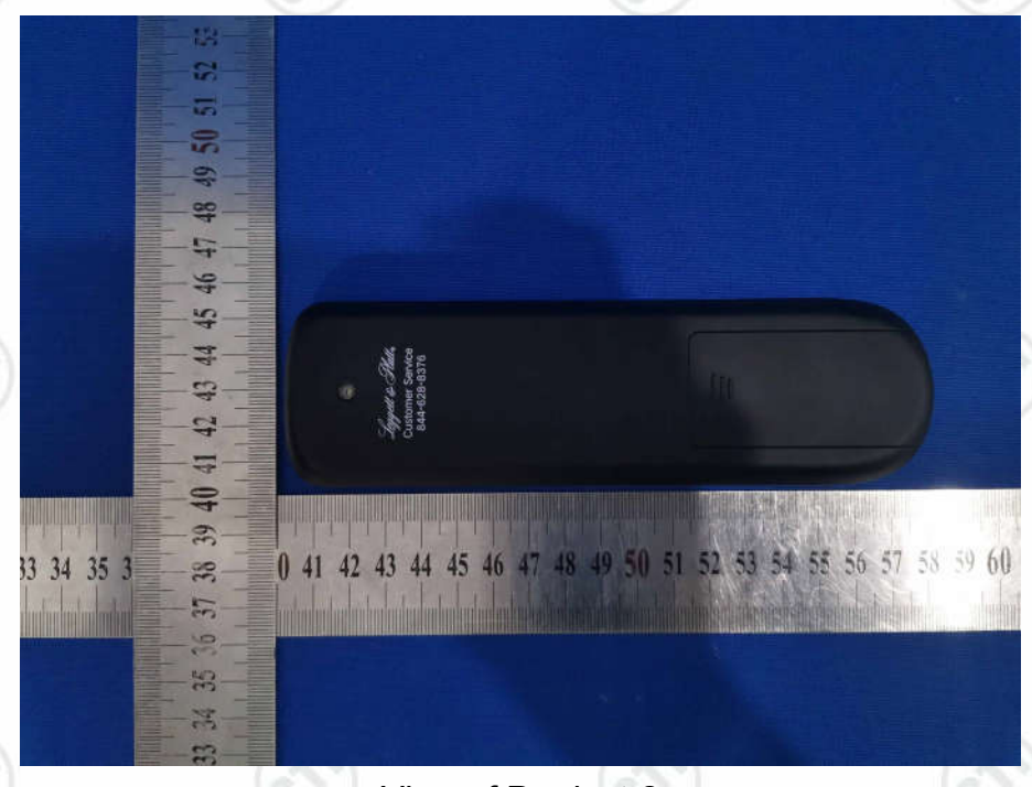
View of Product-2