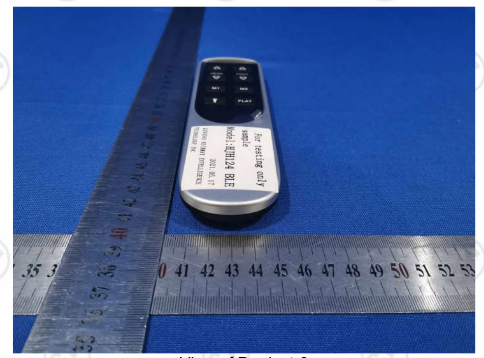
View of Product-6