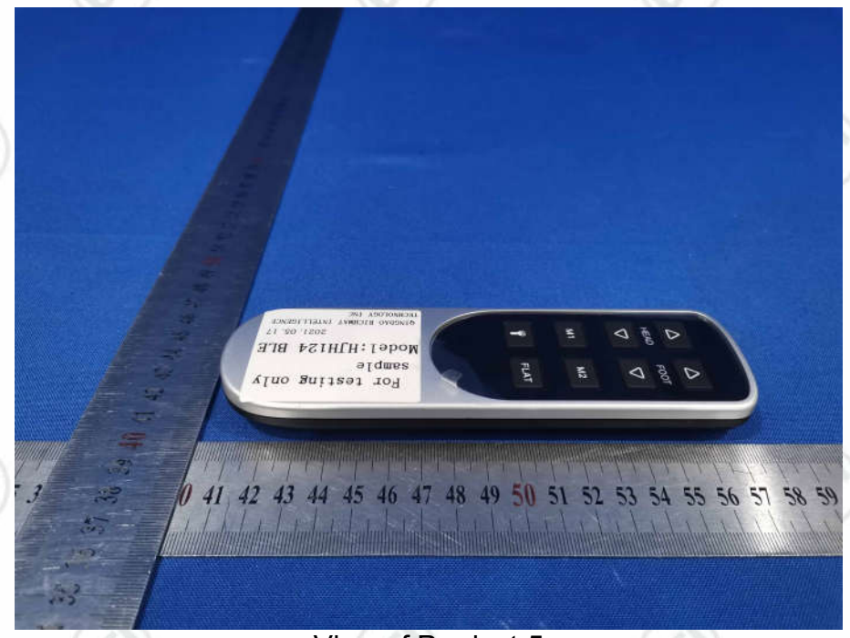
View of Product-5