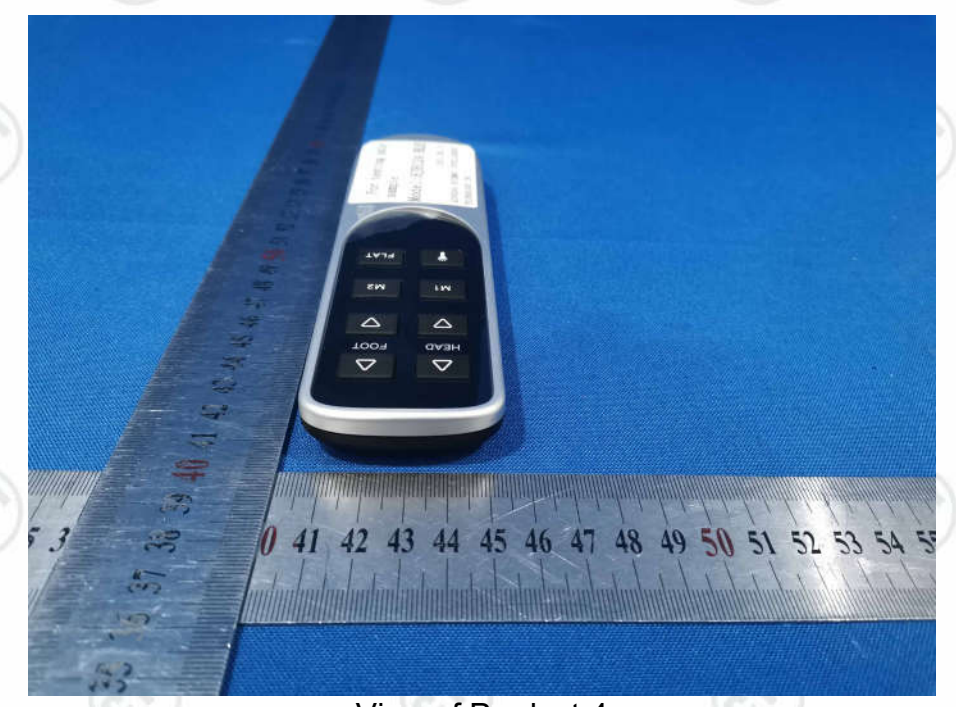
View of Product-4