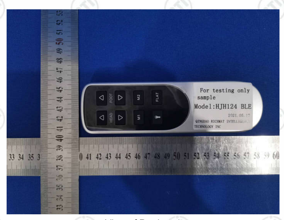
View of Product-1