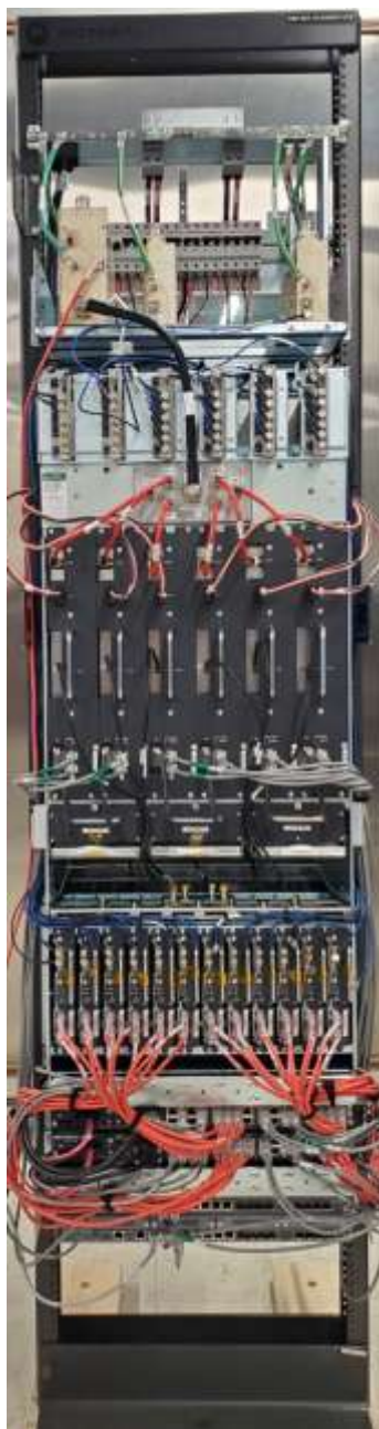
External Front View of DBR M12 Site